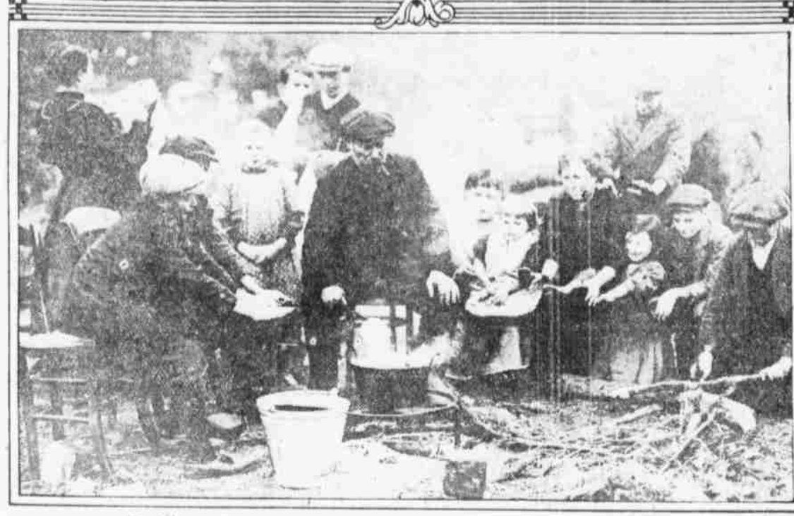
Belgian Refugees Leaving Antwerp-

All the Ills Known to Man Overtook the Wounded and Dying Being Rushed From Antwerp in the Uncomfortable London Buses—The Plight of Civilian Fugitives Seeking to Escape the Hun Advance Was Pitiable