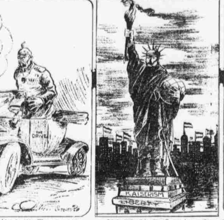
PAGE in Nashville Tennessean