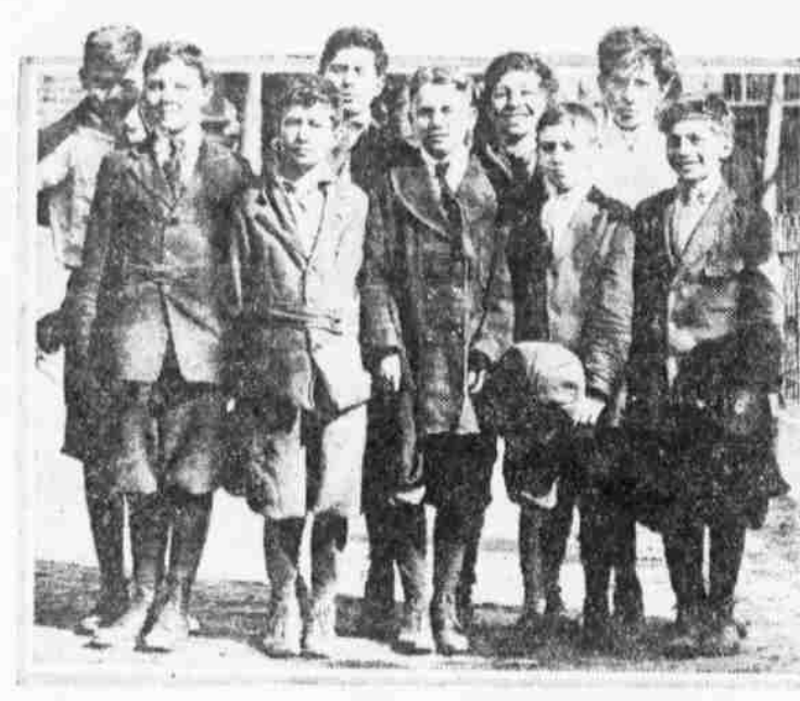
row are twelve years of age; Those in the back are all thirteen. Yet, despite apparent discrepancies, all are boys of normal development Average Heights of Children

The following table is the standard of increase of about now implies. After average beights used by the Children's twelve mouths of age a child grows Bursan for their measuring during the children's year: Average Heights of Children Average Heights of Children Tooys cities Bureau for their measuring during the