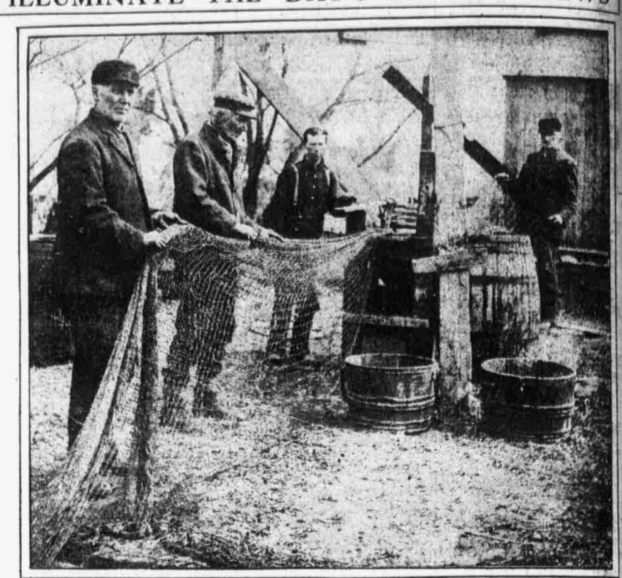
THE SHAD SEASON is with us again, as all lovers of that delectable fish need not be reminded. Still, it is necessary to note that the shad have now put in their appearance in our own Delaware, all of which accounts for this repairing of nets in the neighborhood of Gloucester City, N. J.