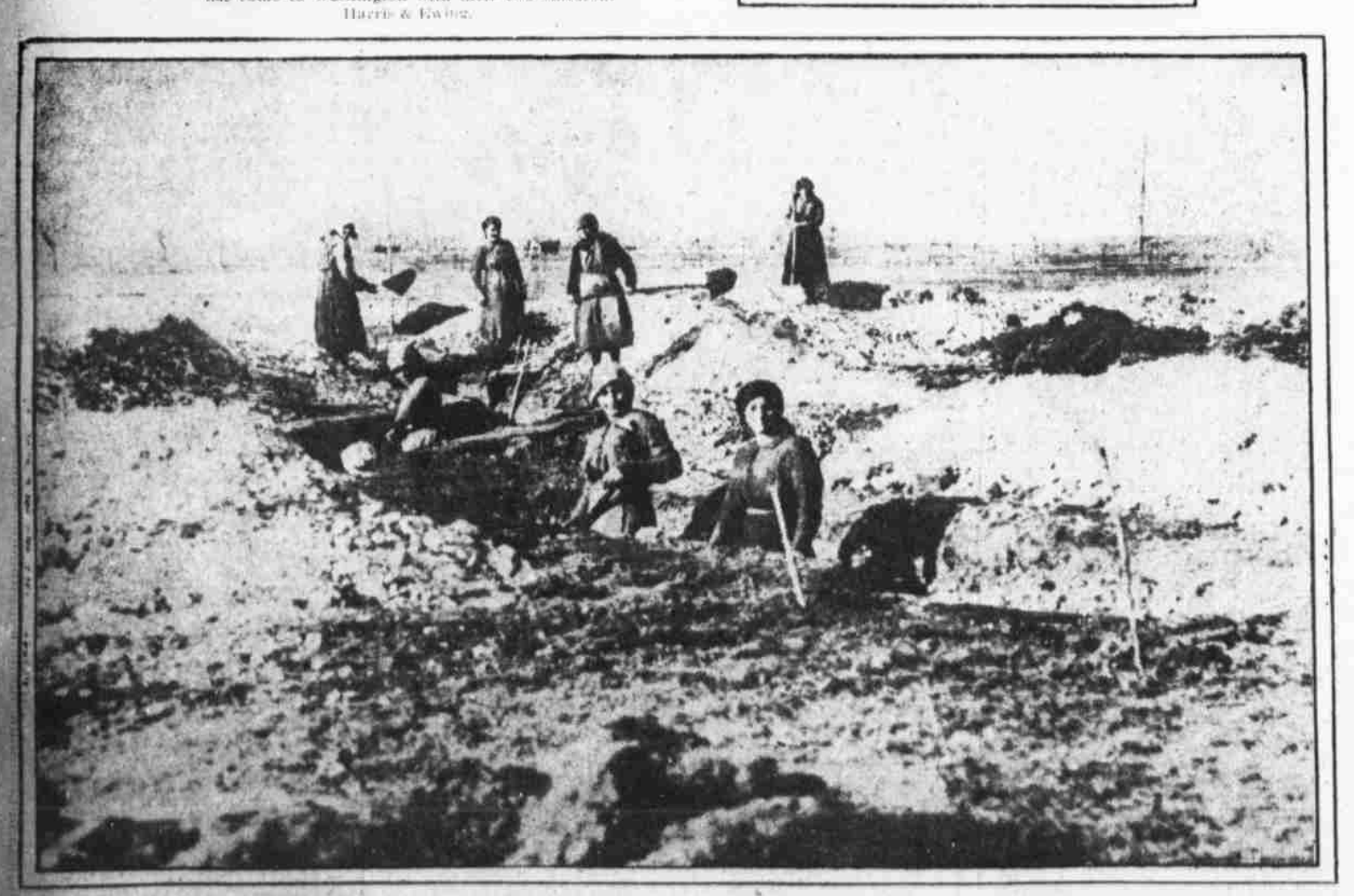
NOW THEY'RE DIGGING TRENCHES, those women, and we men scarcely know what to look for next. The Italian women are the first to go thus to work digging reserve treuches rearward of the battleline in Italy, and to all appearances they seem to be making a good job of it-