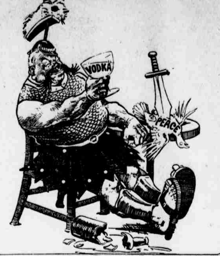
"HERE'S TO DEAR OLD TROTSKY.!"