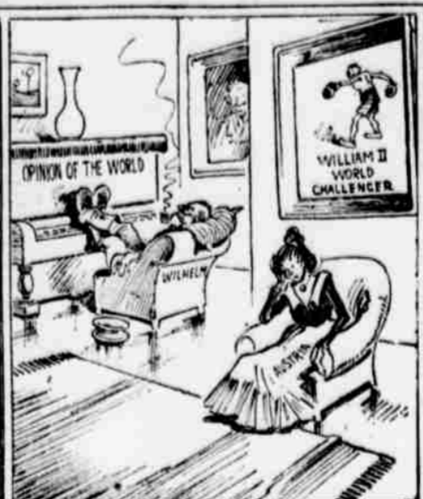
ANOTHER OF THOSE DISAPPOINTING MARRIAGES FOR A TITLE... Thrill in The St. Louis Star