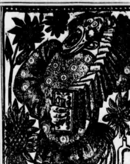
AT LAST... THE REVOLUTION HAS PRODUCED HARMONY... From Navy Satirikon, Petrograd