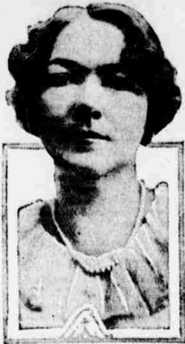
BLANCHE BATES Noted actress, who, in an appeal for immediate enlistments in branches of the service now open, urges all women to get behind the man behind the gun.

THE spirit of patience—this is the message of Blanche Bates to Philadelphia women. Patience that they may back up the men already in the service of their country; patience that they may urge the men to make the most of their tremendous sacrifice, to volunteer for the fight to down the German.