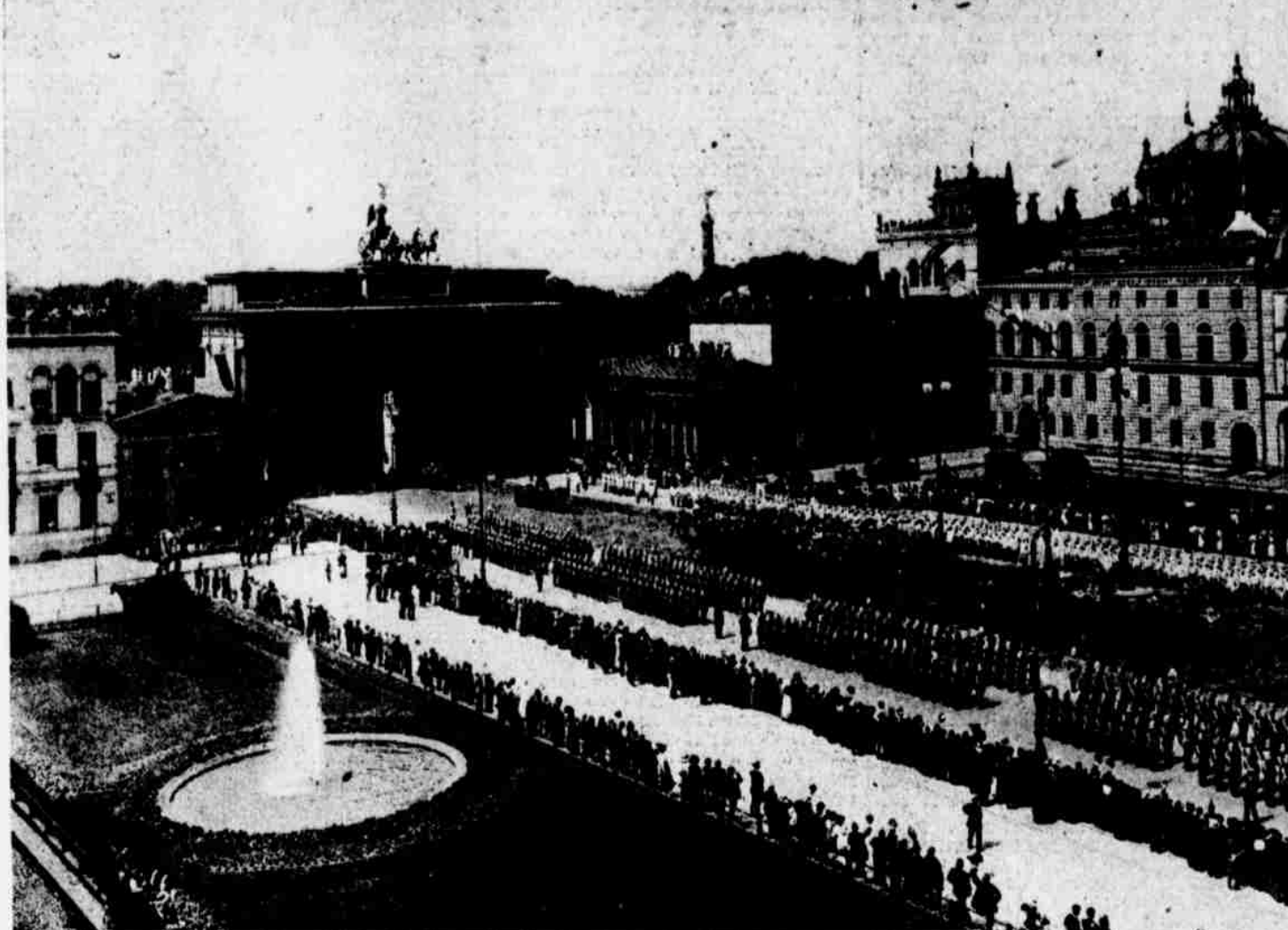
The tower of the German Reichstag building, the source of the poisoned news supply which keeps the deluded people of the Central Powers in submission, is shown at the right of the photograph looming above the famous Brandenburger quadriga at the extreme western end of the famous avenue, Unter den Linden. The quadriga was brought to Paris by Napoleon, but later returned to the German capital after the downfall of the "Little Corporal."