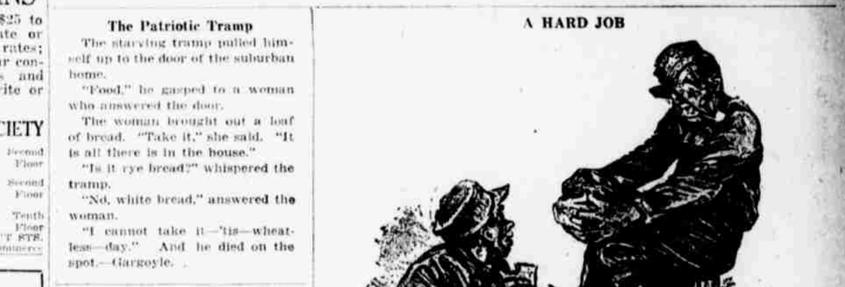
A HARD JOB