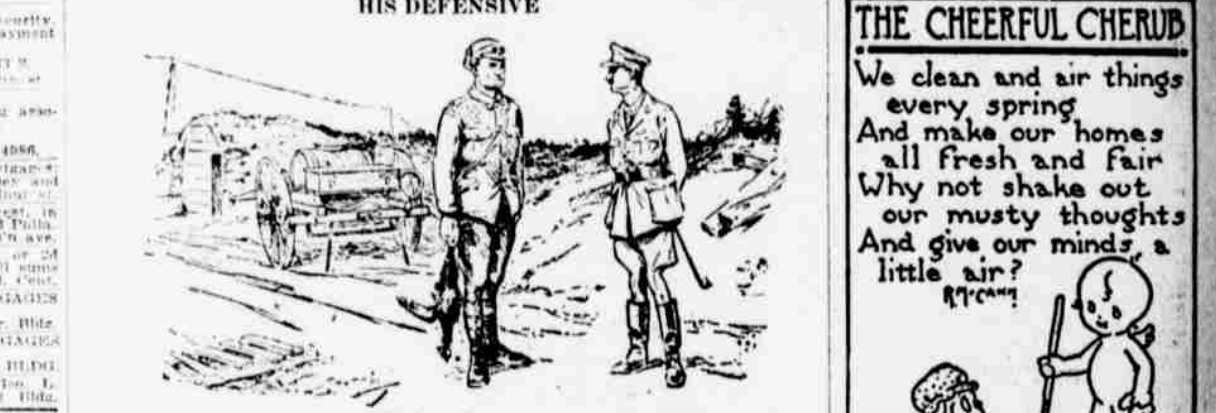
THE PATRIOTIC TRAMP