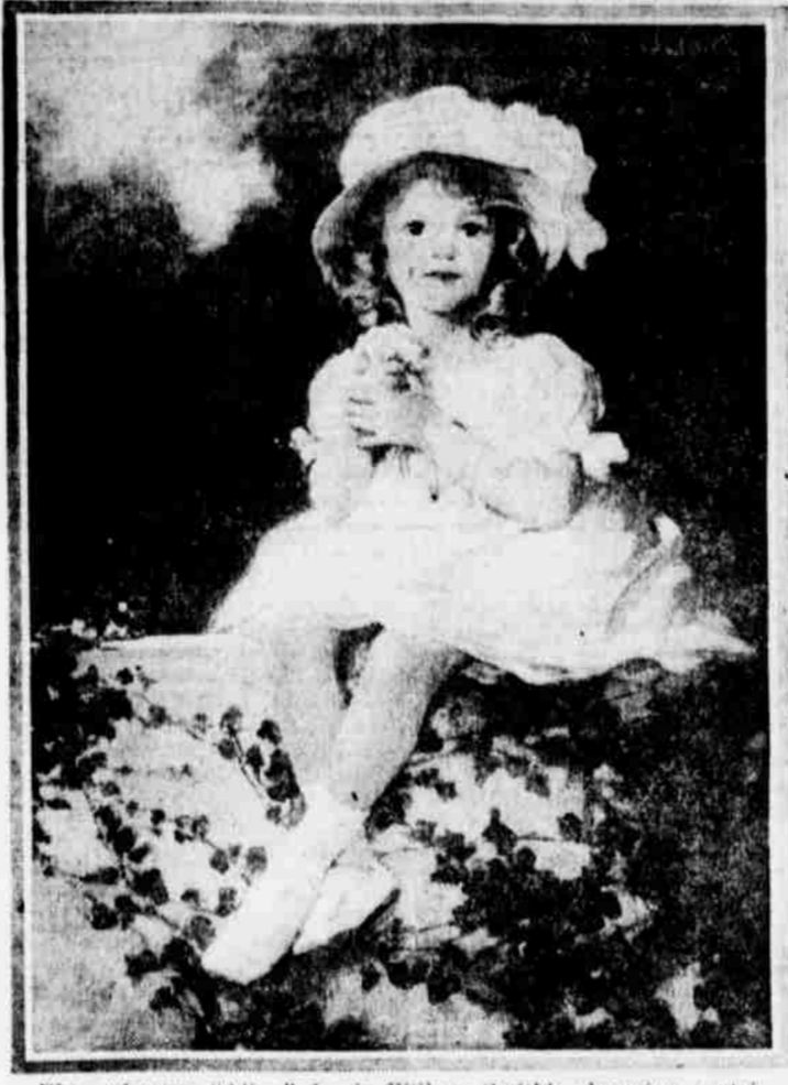
Wee, winsome "Alice," Jessie Willcox Smith's charming contribution to the 113th annual exhibit of the Academy of the Fine Arts, was crowned queen in a popularity contest held among 500 school children, who viewed the exhibit as guests of the Civic Club. The portrait is one of the most winning of all Miss Smith's felicitous studies of childhood.