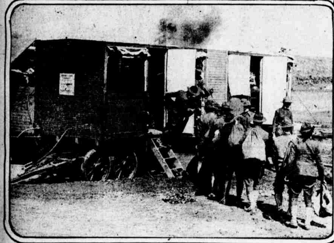
SLOWLY BUT SURELY our soldiers are being supplied with as many comforts of home as befit men whose business it is to fight and not be "soft." The newest "housewife" at Camp Meade is this portable laundry, which in a single week can rejuvenate the wardrobes of 4000 men. A twenty-two-horse-power tractor does the rubbing.