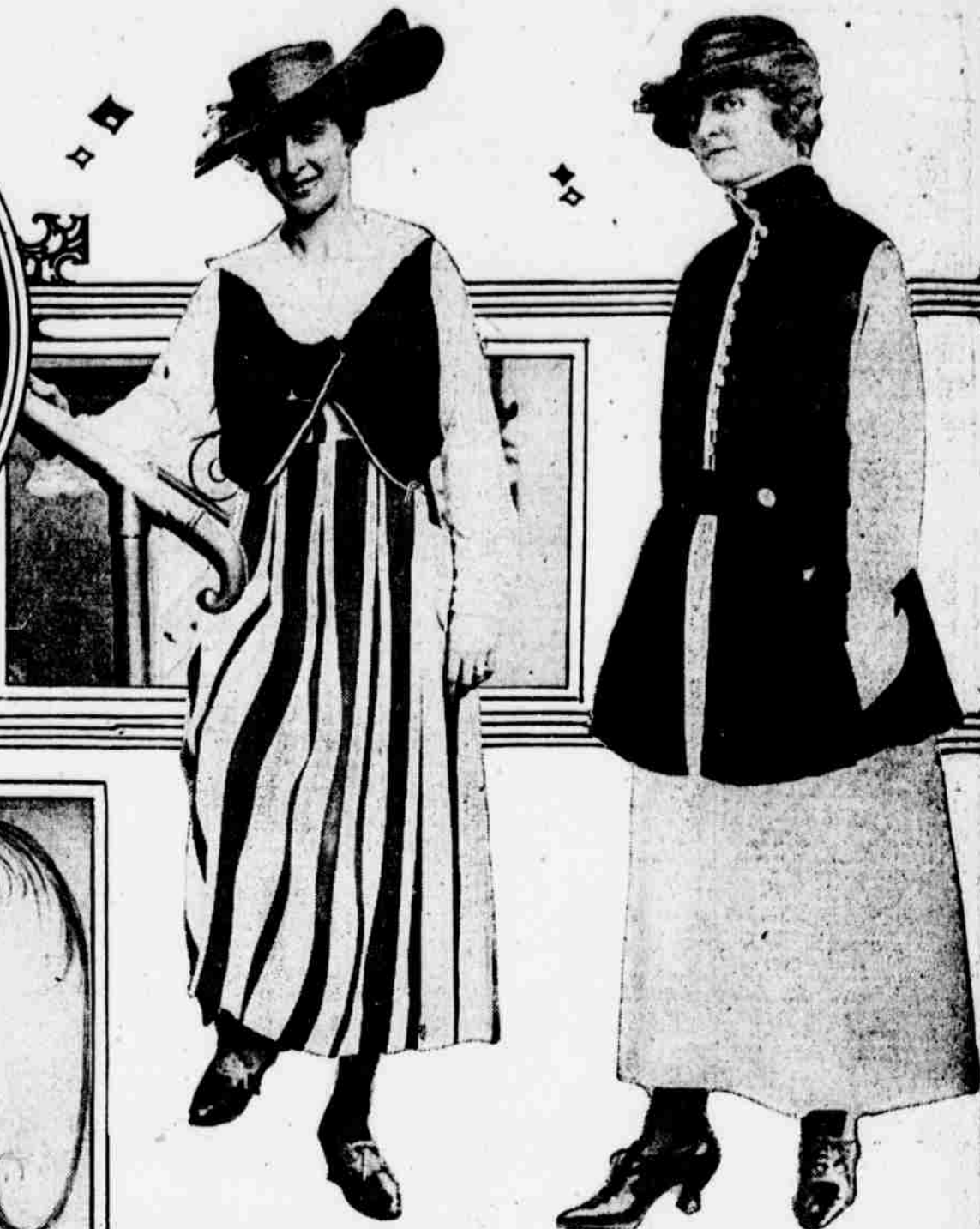
A WINNING ETON JACKET of black with a black-and-white stripe. The hat is a new double-flare model of black leghorn and lace, trimmed with osprey to match velvet, with a bound edge, marks this costume. The skirt is of washable satin.