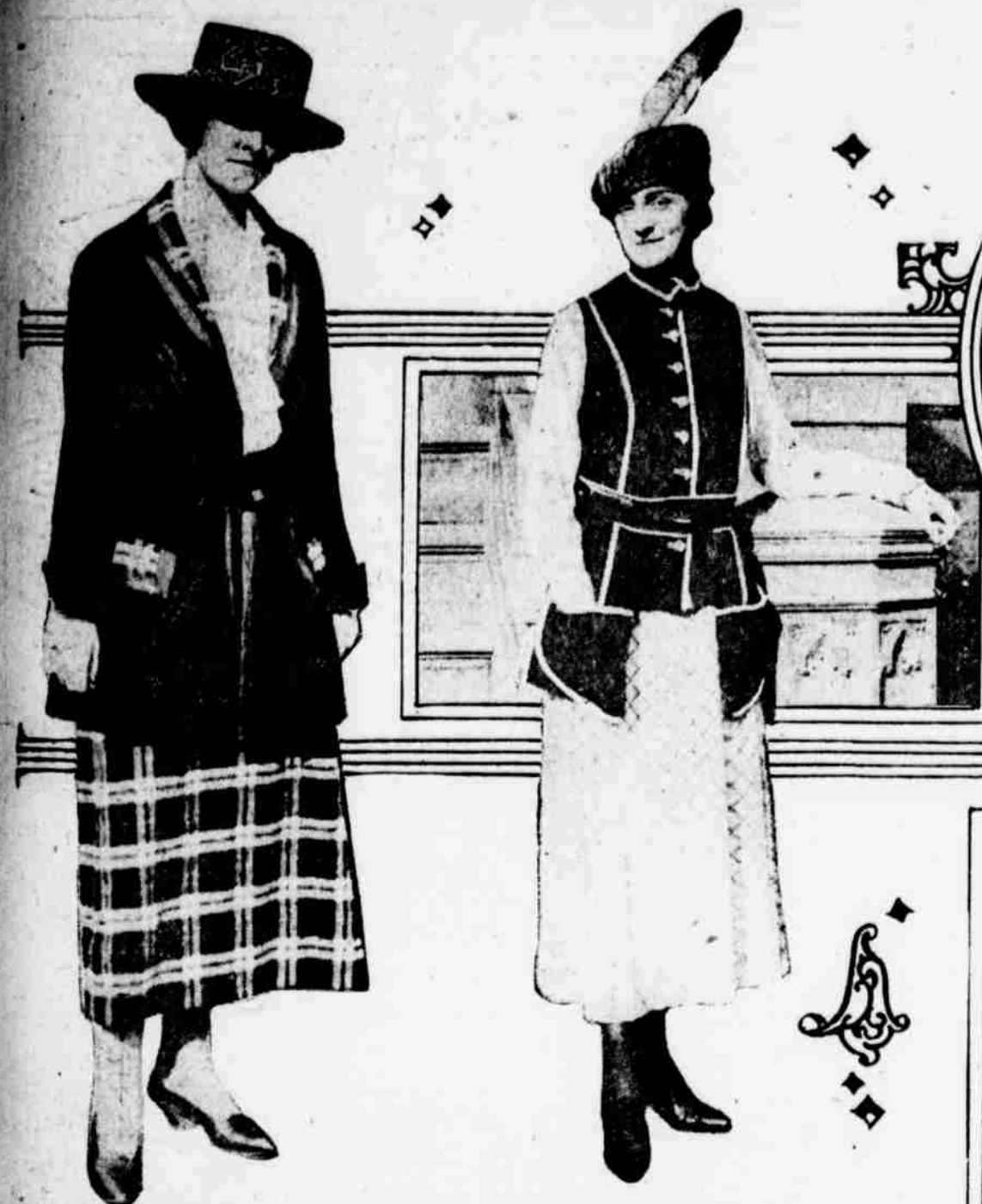
TAILORED SUIT , with an English plaid skirt and black tricotine coat. A combination plaid adorns the collar, cuffs and pockets of the coat. The hat is a black sailor, with a harmonizing black-and-white silk band.