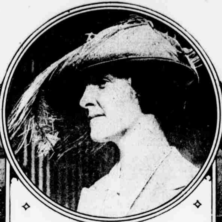
AN ATTRACTIVE BONNET , champagne in color and hand-somely adorned with an ostrich trimming.