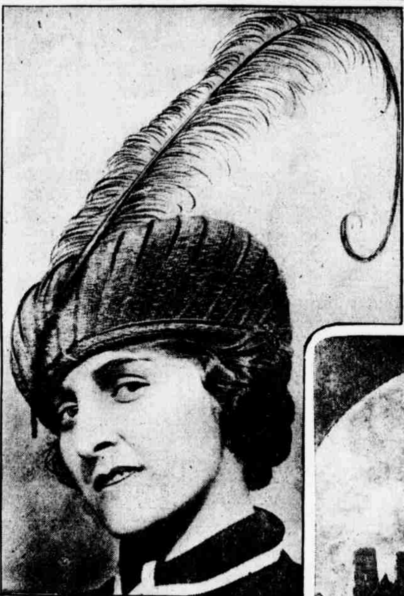
HERE YOU HAVE a bonnet of blue milan, with a sweeping black feather as ornamentation.