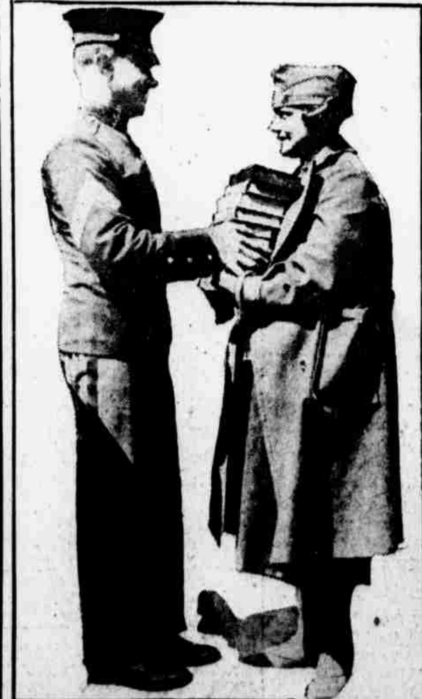
WHO WOULDN'T GIVE BOOKS to such a fair solicitor? Being students of human nature, the marines who are helping the drive for books for soldiers have brought the persuasiveness of pretty maids into effective play.