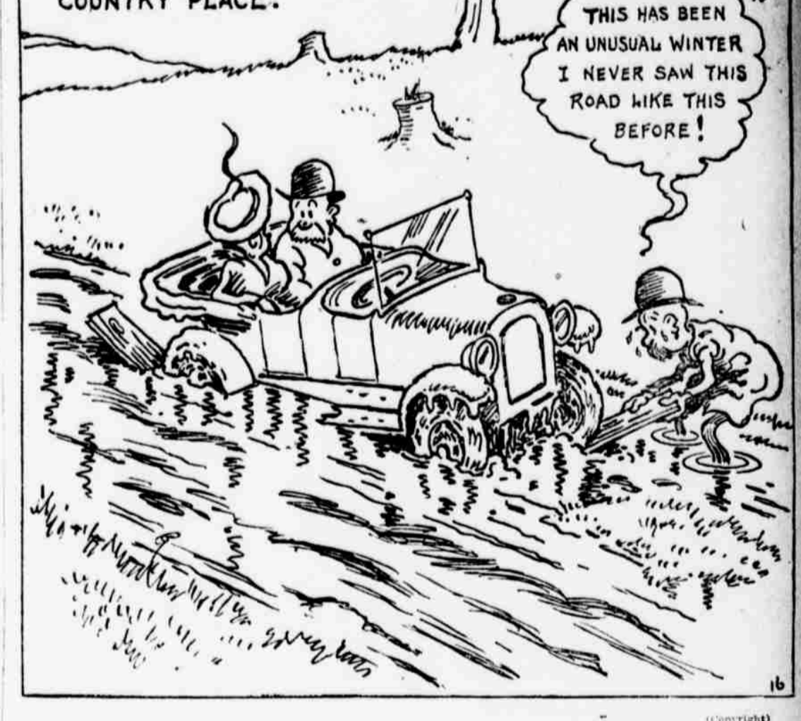
No Stops SCHOOL DAYS

THE REAL ESTATE AGENT WHO IS TAKING SOME PROSPECTIVE PURCHASERS OVER TO LOOK AT AN "ALL YEAR" COUNTRY PLACE.