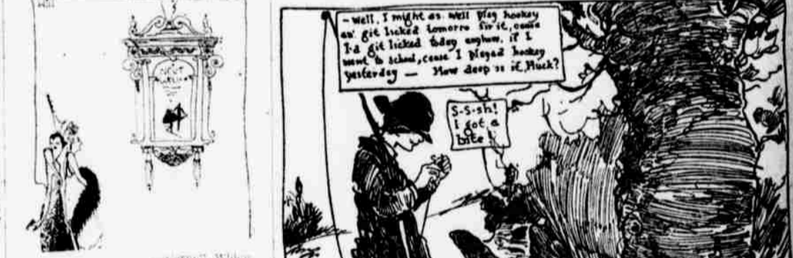
The Young Lady Across the Way