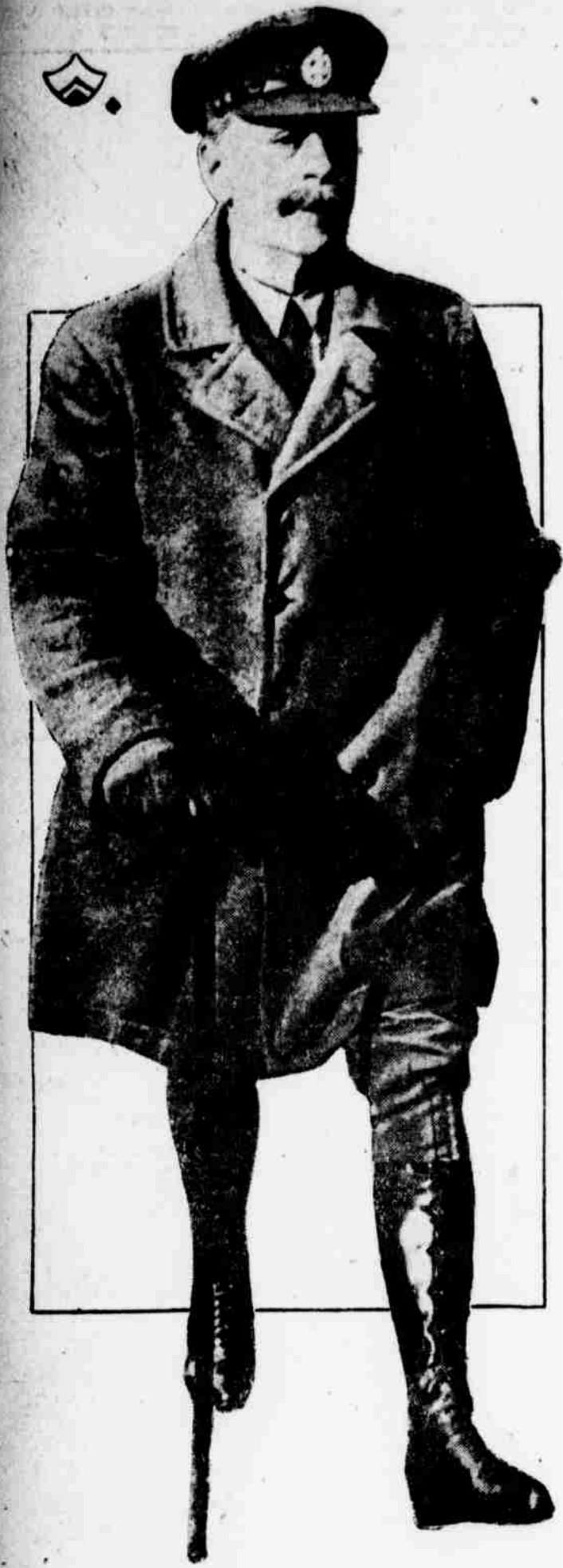
YOU CAN LOCK A MAN UP for almost anything under the defense of the realm act, and that's why Colonel Repington, England's distinguished military critic, came to grief when he ran afoul of the censors. The "affaire Repington" closed with a fine of $500 for the redoubtable soldier. Western Newspaper Union.

FROM WAR TO THE LIGHTER SIDE OF LIFE, THE CAMERA TURNS IN ILLUSTRATING THE DAY'S NEWS