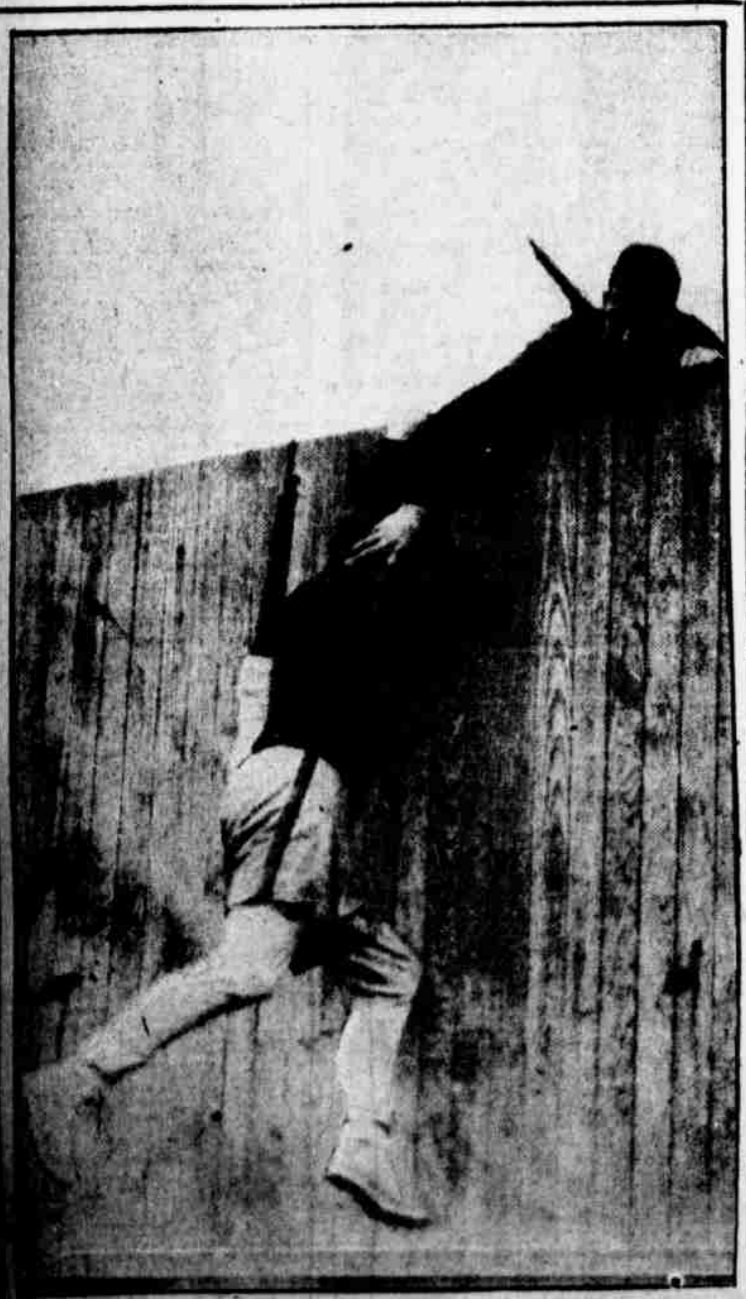
IT'S A DIFFERENT SORT OF "over the top," but these lads, who are going through the strenuous course in military athletics now at the University of Pennsylvania, are going "over the top" and it would take quite some elevation to stop them.