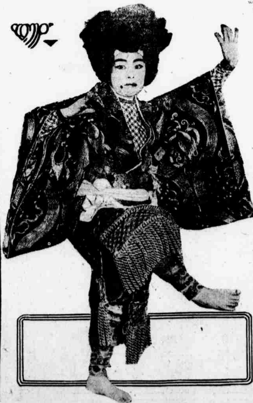
FROM OUT OF THE LAND of the Rising Sun comes the tiny Mlle. Kimura, most famous of all Nipponese dancers, in search of new laurels before audiences American. Her trunks are filled with kimonoes of exquisite silk—only less wonderful than Mlle. Kimura herself.