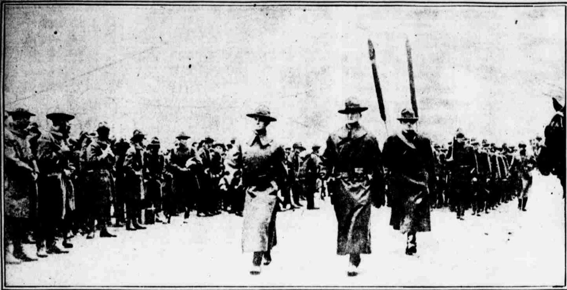
HERE THEY COME, many thousands strong, fresh from their hazardous voyage through the submarine-infested Atlantic. See how proudly they step out, these Sammees, happy to leave shipboard for the virgin soil of France, which they have come to defend. Sea legs won't bother them again till the Germans shout, "Enough!"

LIVE PHOTOGRAPHS OF BIG NEWS HAPPENINGS, THE WAR AND PERSONS YOU READ ABOUT