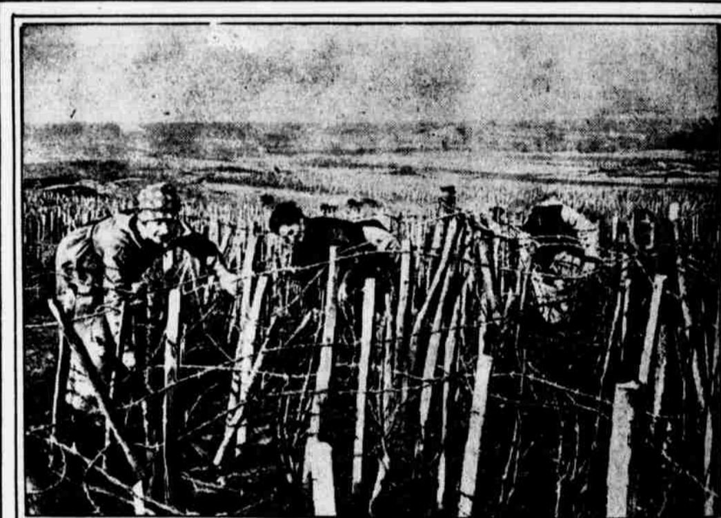
HERE'S A NEW SUBJECT for a Millet. If the great Frenchman were alive today and his master eye were to fall upon this scene he perhaps would immortalize the courage and devotion of the peasant women, who carry their work of reclaiming the shell-torn soil to the barbed wire surrounding a French battery position itself. And what a target they would make for a Boche gunner!