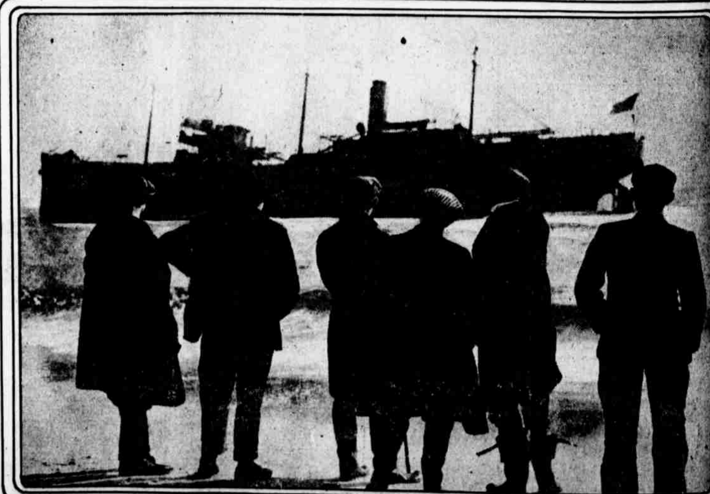
MEN WHO GO DOWN TO THE SEA in ships are always in danger of waking up some fine morning to find themselves high and dry on the shore. That wasn't exactly the experience of the crew of the steamship Susquehanna, which went aground in a storm off Tom's River, New Jersey, but the fact remains that they paid an unexpected visit to the Jersey shore. At this writing attempts are being made to refloat the Susquehanna.