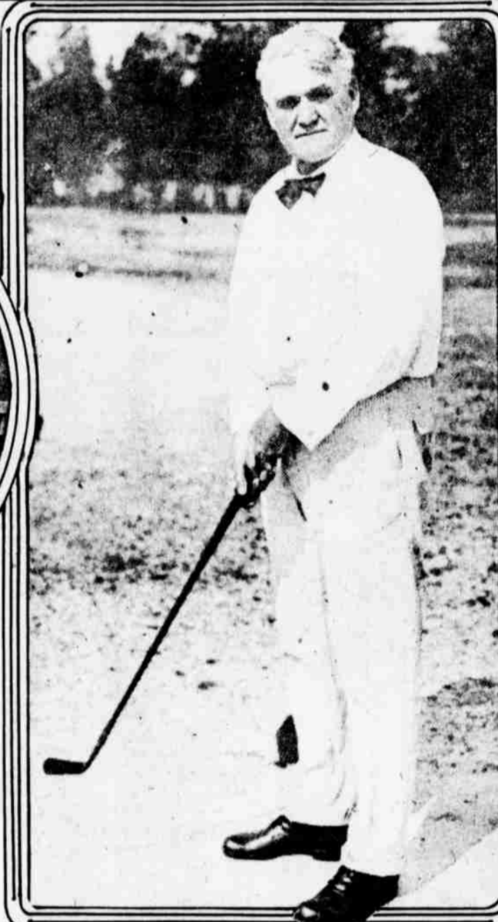
"FORE!" THAT WARNING had better be respected when the formidable bulk of Governor Brumbaugh is behind a golf club. According to all reports, political worries haven't prevented Pennsylvania's chief executive from playing his usual game on the links at Pinehurst, North Carolina.