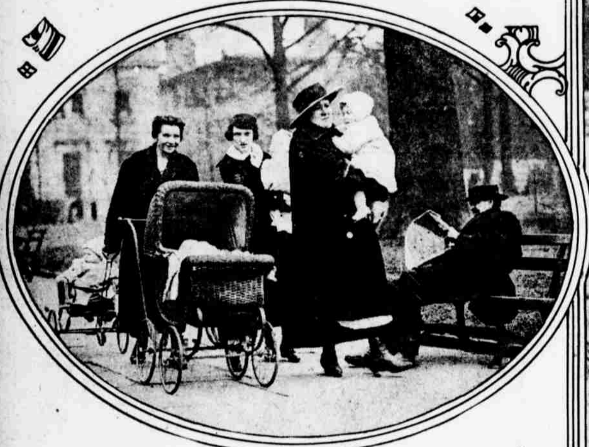
WARS MAY COME and wars may go, but the babies will be with us forever. And, by the way, their appearance in the public squares is the first incontestable sign of spring. The bench-warmers (note "His Leisureness" in the photograph) run them a close second. Some one left a newspaper on a bench, and then—oh, bliss for the news!