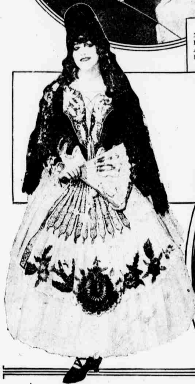
One of the Spanish Dancers in "The Land of Joy," a New-comer at the Forrest.