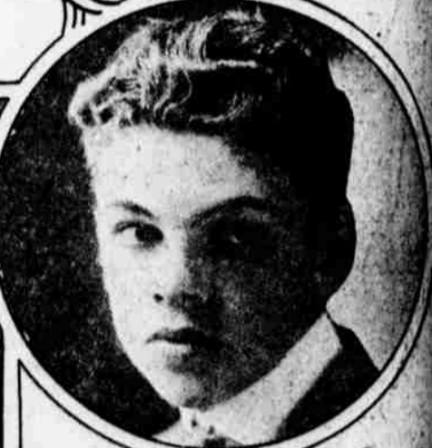
Albert Hackett in "Children of France," Alhambra.