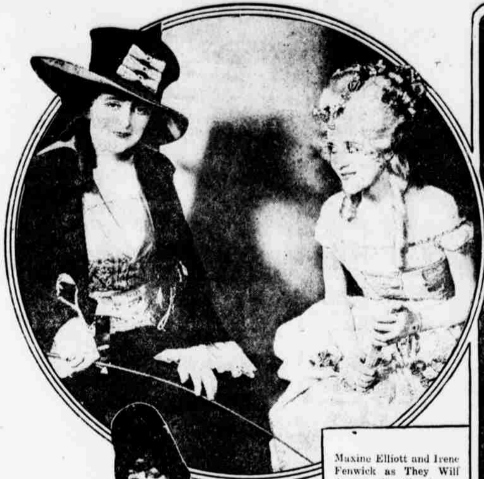
Maxine Elliott and Irene Fenwick as They Will Appear in "Lord and Lady Algy" at the Lyric.