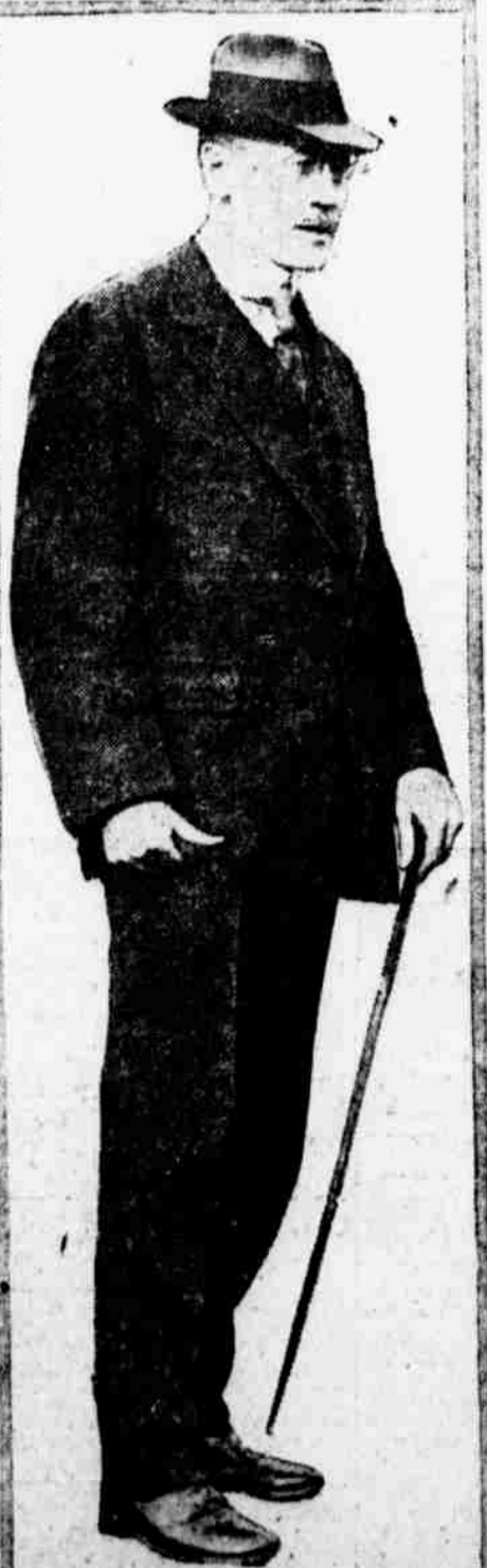
Dr. R. Tait McKenzie, Back From England With Valuable Pointers About Military Athletics, Is Over