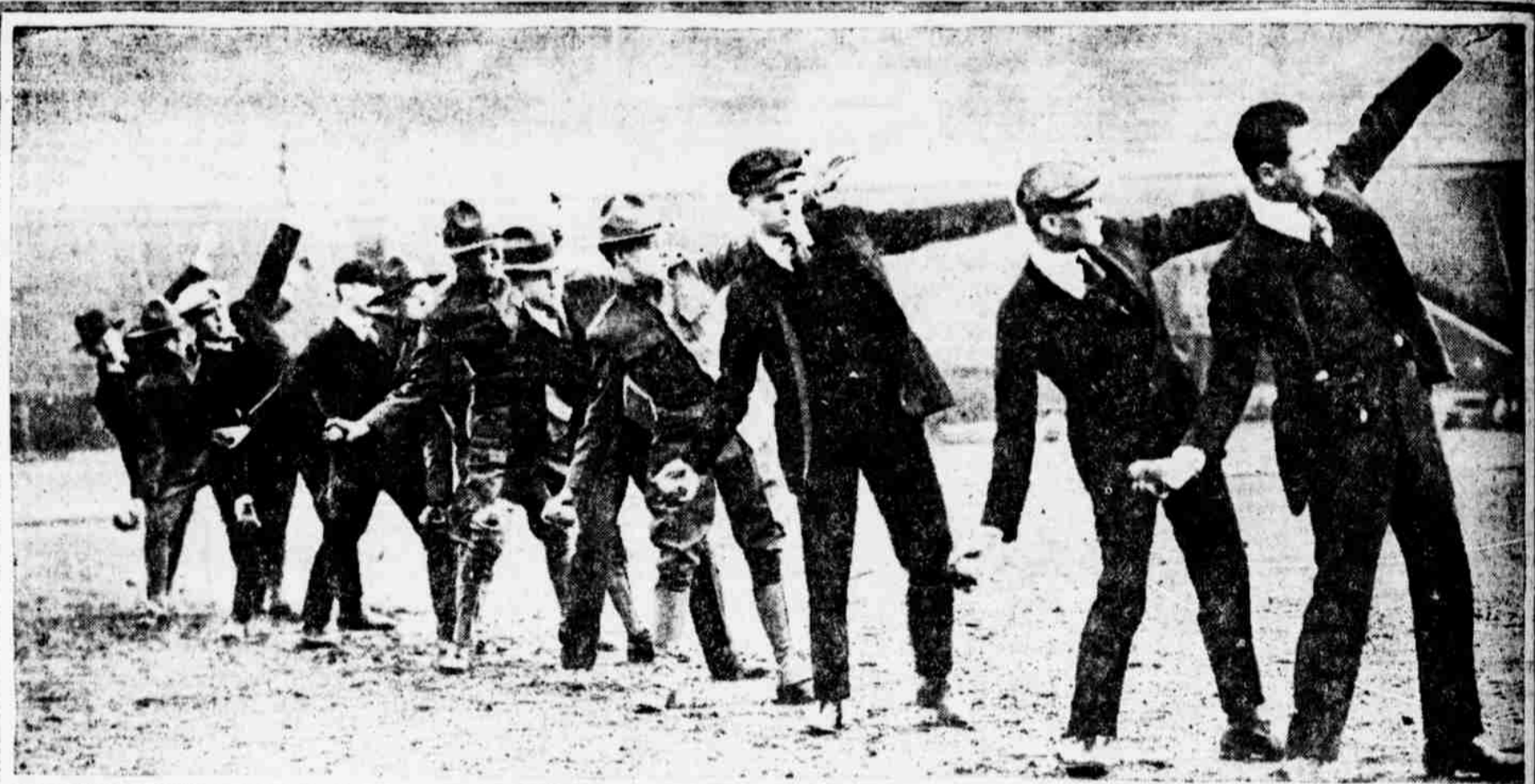
The University of Pennsylvania Is on a War Basis Now, and Every Student Is Required to Devote One Hour Each Day to the New Course in Military Athletics. The Students Are Divided Into Small Groups for Practice in Hand-Grenade Throwing (as Illustrated Above) and Other Routine Requirements of a Modern Soldier.