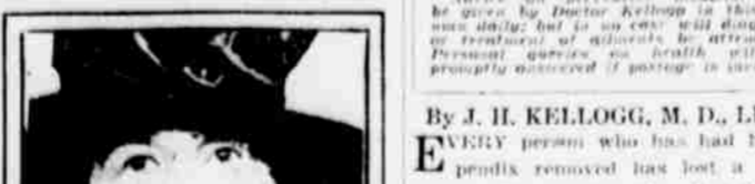
ISABEL DUER WEST