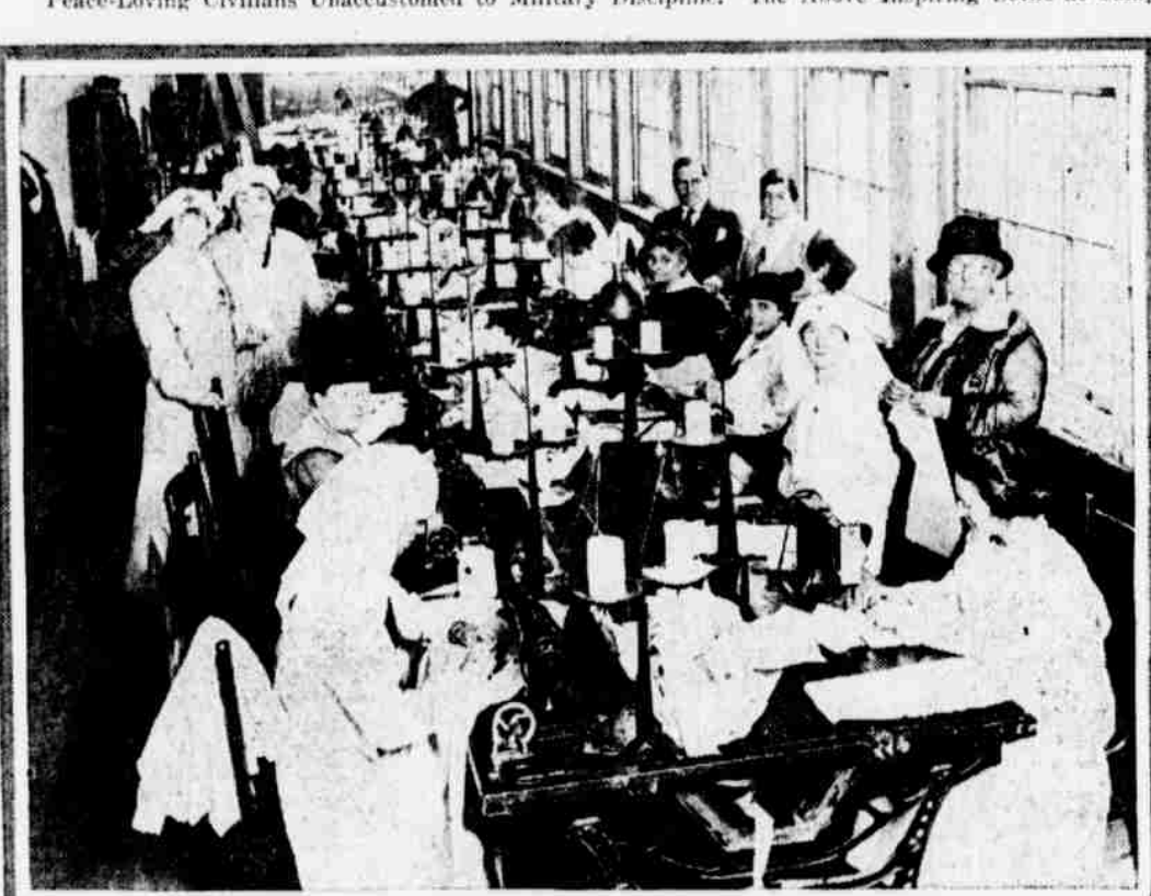
Philadelphia Society Women in Their Zeal for Relief Work Have Taken Possession of a Real Factory on Market Street and Are Turning Out Considerable Quantities of Clothing for War Sufferers.