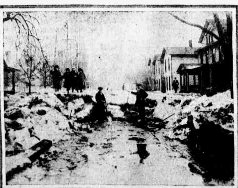
An Ice-Packed Street at Lock Haven, Pa., After the Worst Flood in Years Had Receded Last Week. The Men in the Foreground Are Relief Workers From Jersey Shore, a Nearby Town on the Susquehanna,