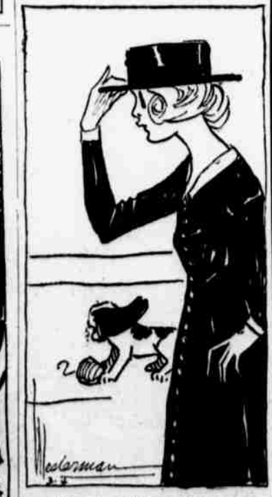
The young lady across the way says she saw in the paper that the Germans are going to interrogate American prisoners sharply and she wonders if they realize that in the end they will have to pay for every