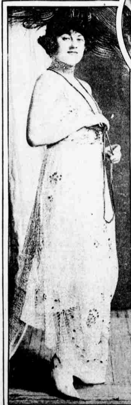
The Lyric Presents Lillian Lorraine in "Odds and Ends of 1917."