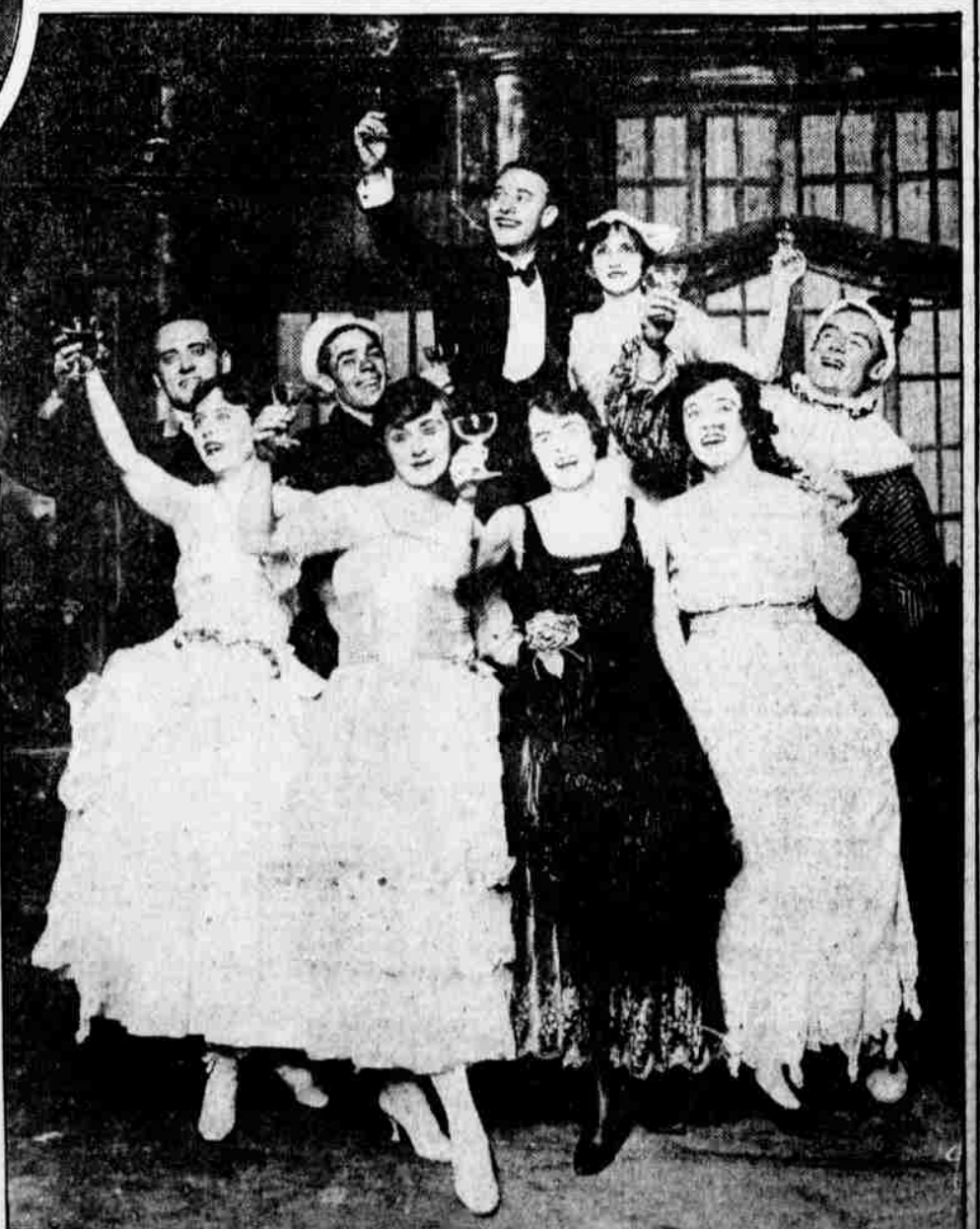
A Scene From the "Man Who Came Back," Now at the Adelphi.