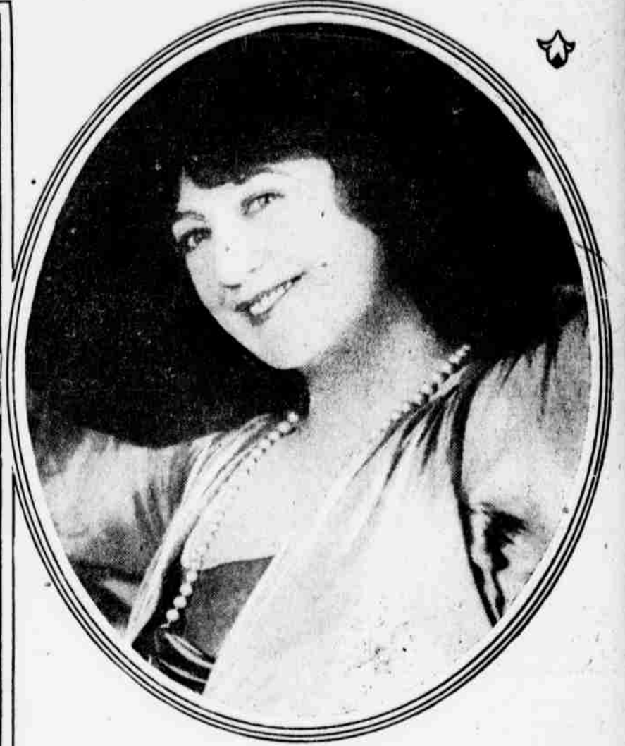
Vaultville Lovers Will Find Blanche Ring Furnishing a Headliner at Keith's.