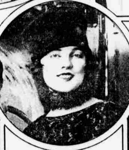
At the Chestnut Street Opera House Justine Johnstone Appears in "Over the Top."