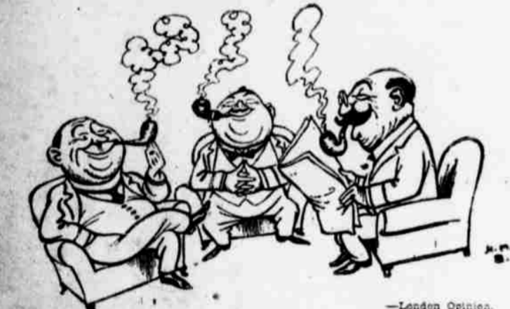
"It is usually felt in the trade that the cigarette smoker will first, and most noticeably, feel the pinch."