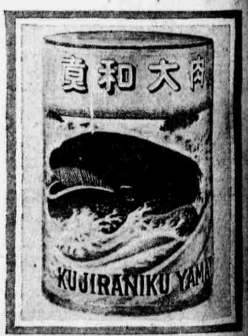
Cans of Whale Meat, Such as the Above, Are Finding Their Way Into the United States From Japan, Where Whale Has Long Been a Popular Food.