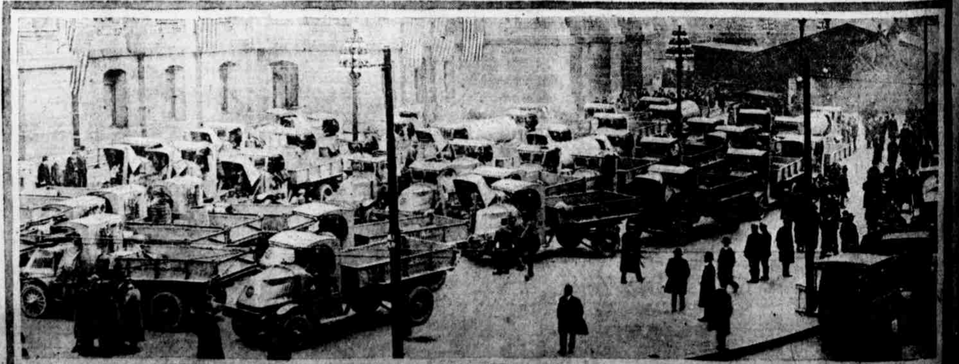
Fleet of Sixty United States Motor Transports Which Arrived in Philadelphia Late Yesterday Afternoon From Trenton en Route to "Somewhere in America" Encamped for the Night on City Hall Plaza.