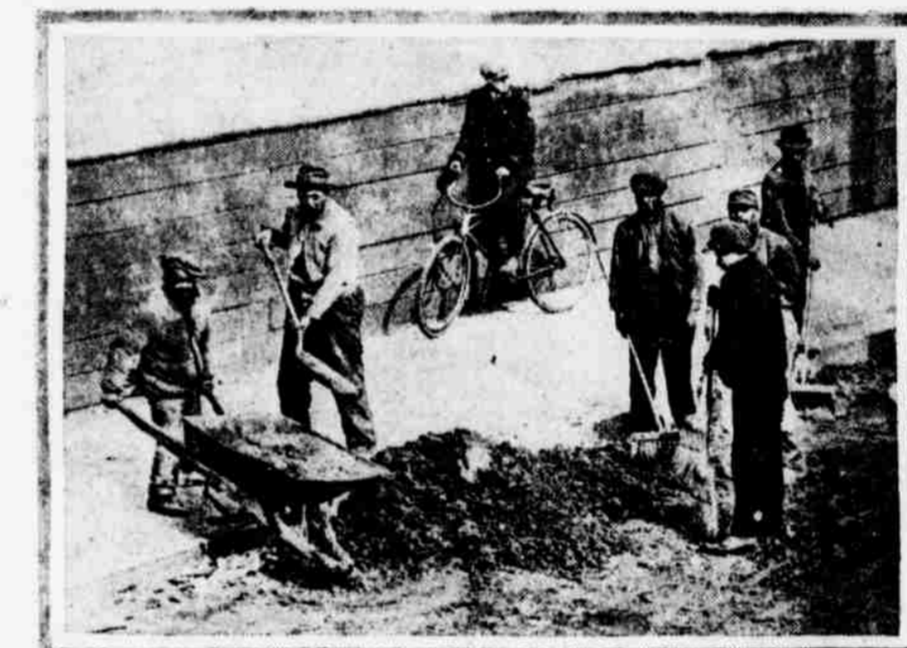
Citizens Dissatisfied With the Condition of Streets in Their Neighborhood May Find a Solution in the Example of the Walter Bradley Coal Company Which Set Its Employees to Work Today Cleaning Thompson Street Between Eighth and Ninth Streets When Complaints to the City Brought No Response.