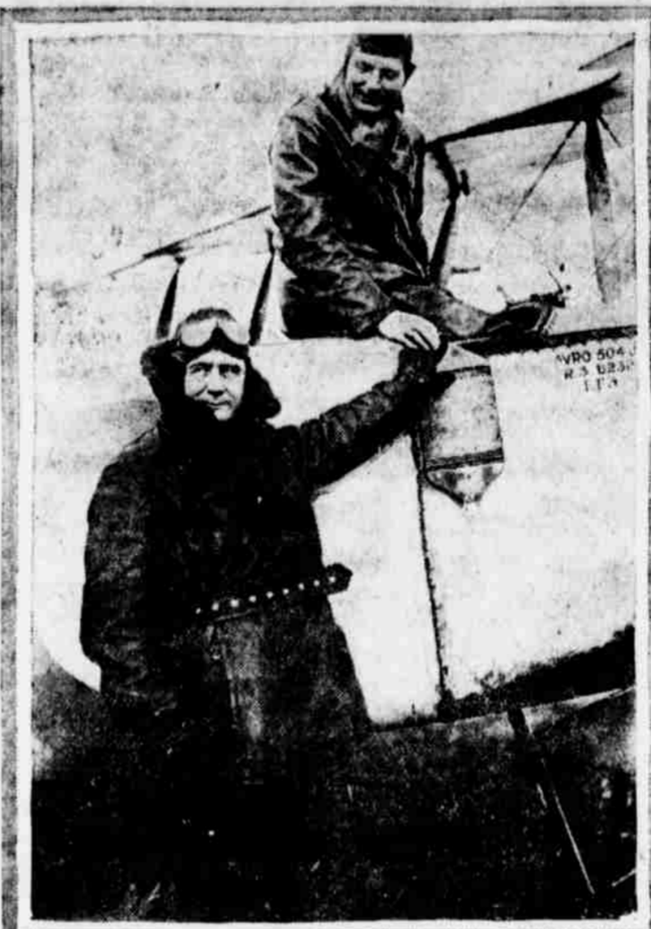
The First Member of Congress to Fly Over the Capitol Was Senator Harry E. New (Standing), Who Accompanied Colonel Charles L. Lee, of the British Flying Corps.