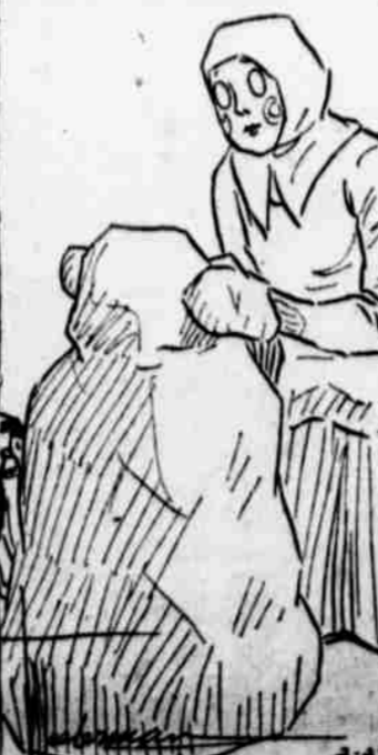
The lady (once young) on this side of the way remarked that it was shameful for those horrid bucket shops to charge the poor so much for coal, and that they ought to be put out of business for it.

—Gosh, look how your dog is scared o' my dog! Ain't that funny how he's shiverin' with fear under the sink? Gee, wait, I would n't have a mutt like your dog! Let's make 'em fight a little, will ya? Ain't my dog brave an' strong lookin'? Gosh, I betcha he could kill your dog in about two bites, don't you?—