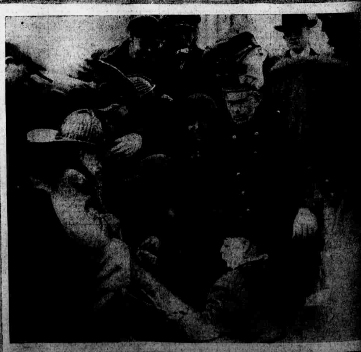
Philadelphia's Morning, Manhole Explosion Occurred at Seventh and Chestnut Streets Today. No One Was Injured by This Latest Blast, Which Caused the Firemen in the Photograph Some Little Difficulty to Investigate.