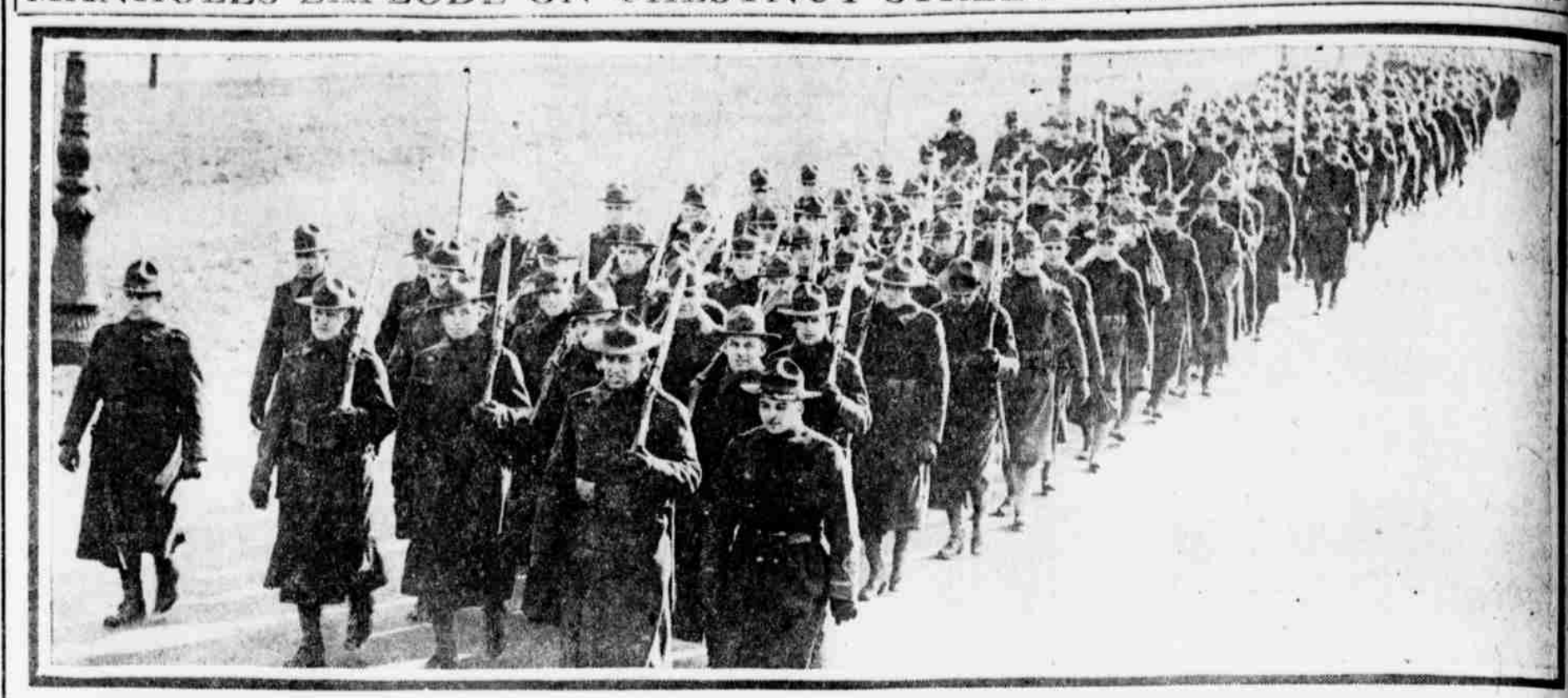
Even if Philadelphia Should Fail to Get the Parade of Her Soldier Sons This Spring, There Is Some Consolation in the Knowledge That a Real Soldier Parade Takes Place Every Day in the Lower End of the City. The Picture Shows the Marines of the First Advance Base Taking Their Daily "Hike" From League Island, The Outing Is an Integral Part of the Training of the Marines, and the Boys Enjoy It Immensely.