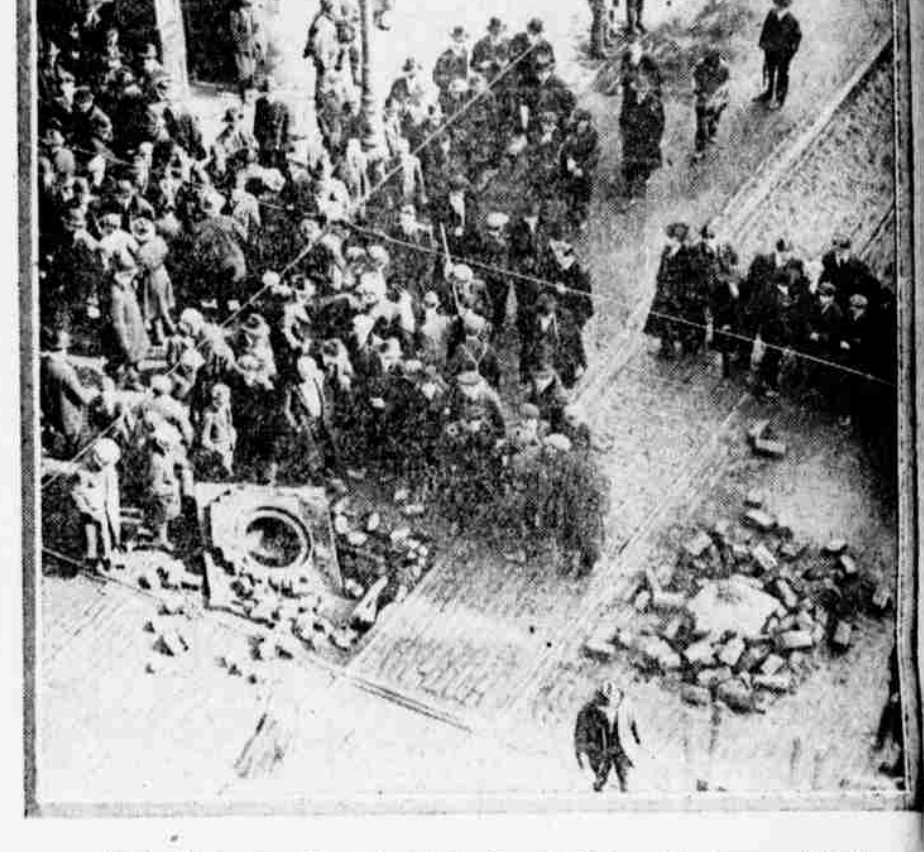
With a Detonation Heard for Blocks, Two Manholes at the Corner of Sixth and Chestnut Streets Exploded Shortly Before Noon Today, Tearing Great Holes in the Pavement. Four Women Pedestrians Were Injured by the Blast and Were Rushed to the Jefferson Hospital in an EVENING PUBLIC