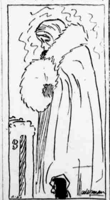
The young lady across the way says she guesses her father's business must be on a very substantial basis now as she overheard him say il looked as if his company would pay its next dividend right out of its capital account.