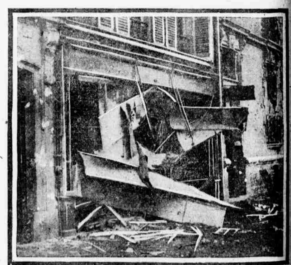
The German Air Raid on Paris on the Night of January 30 Was One of the Most Disastrous Which the French Capital Has Suffered. The Picture Shows How Completely the Front of a Paris Cafe Was Destroyed by a Giant Bomb Dropped From a German Plane of the Gotha Type.