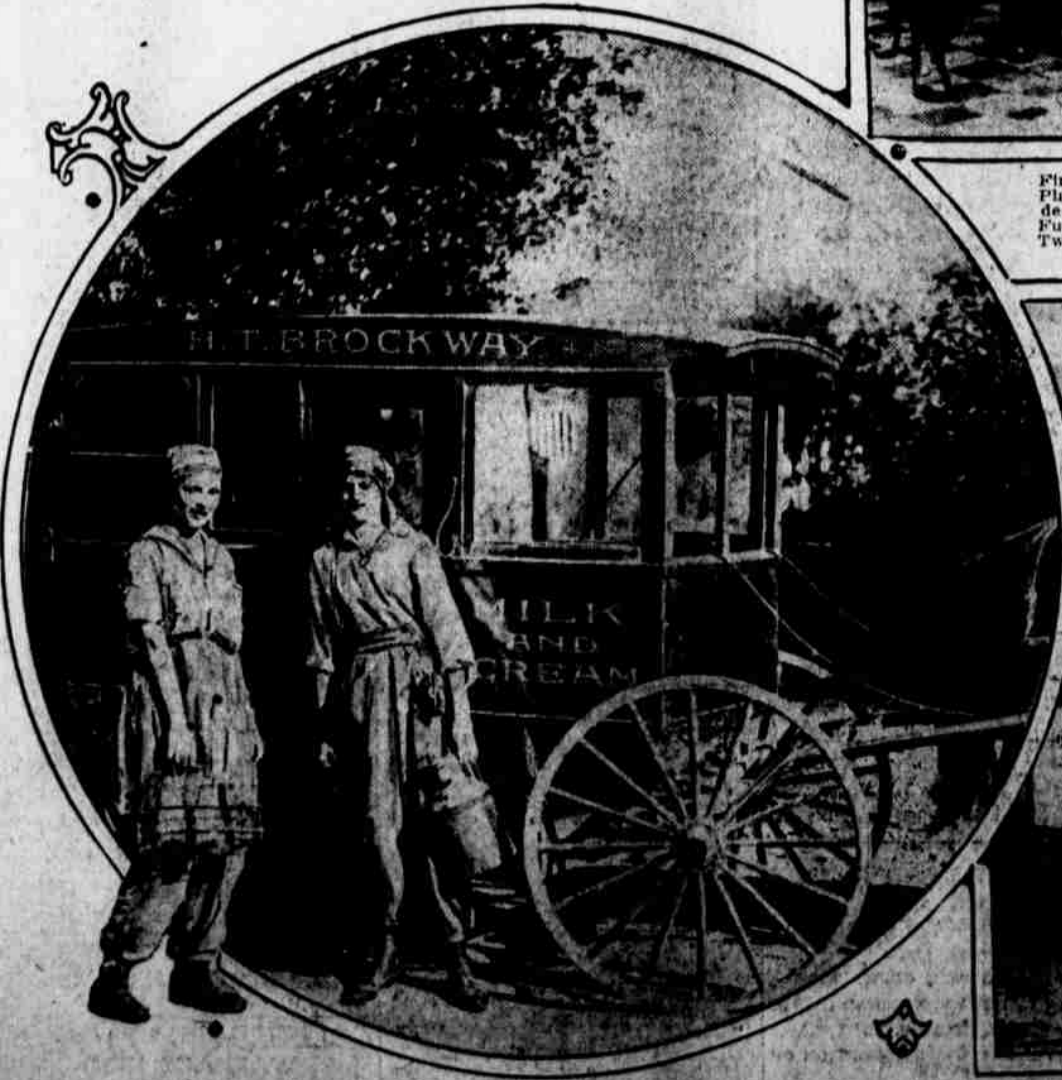
"I'm Going a Milking, Sir, She Said," as She Gayly Counted Her Profits. The "Lady Milkman" is Another Feminine Phenomenon of Wartime, Now That Men Drivers Are Scarce.