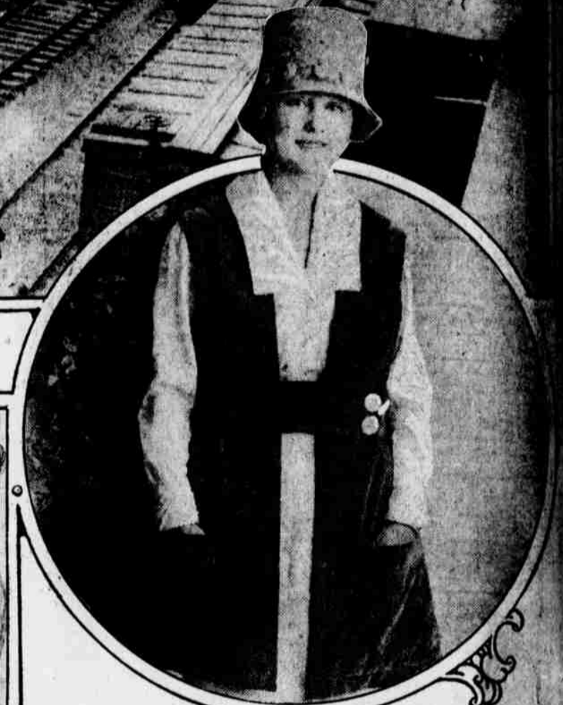
Shortage of Dress Materials Troubles Not the Ingenious Makers of Women's Fashions, Who Now Bring Out a Sleeveless Coat for Next Summer. Western Newspaper Union.