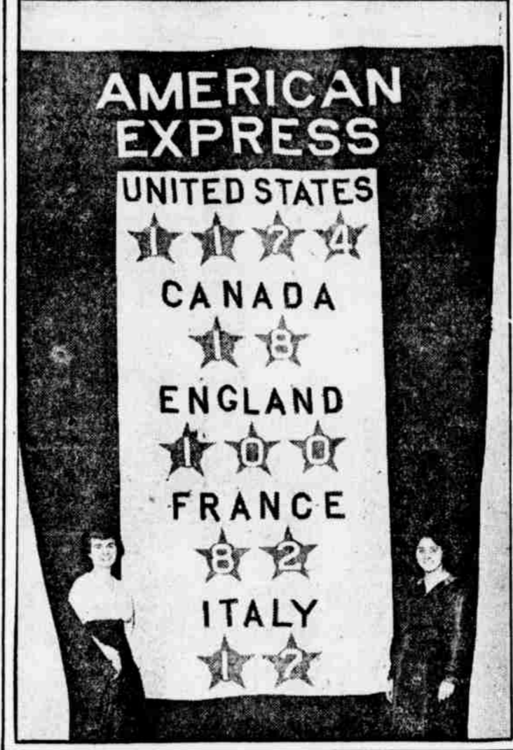
Perhaps the Most Unusual Among Service Flags Is That Which Will Be Flown Next Week From the Office of the American Express Company, at 1127 Chestnut Street. Similar Flags, with the Stars Arranged According to the Nationalities of Former Employees Now in the Service of the Allies, Have Been Displayed in New York and Chicago.