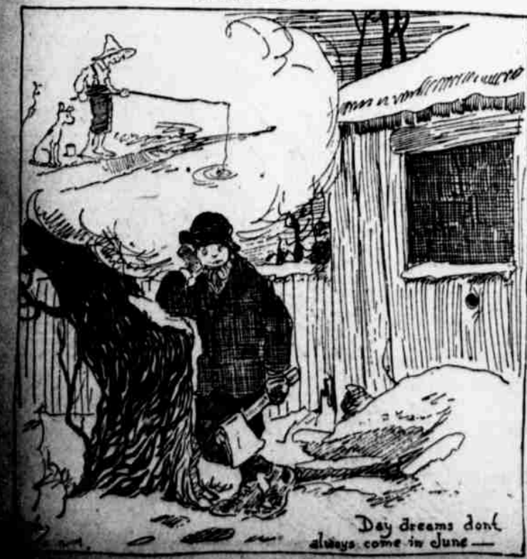
Day dreams don't always come in June.