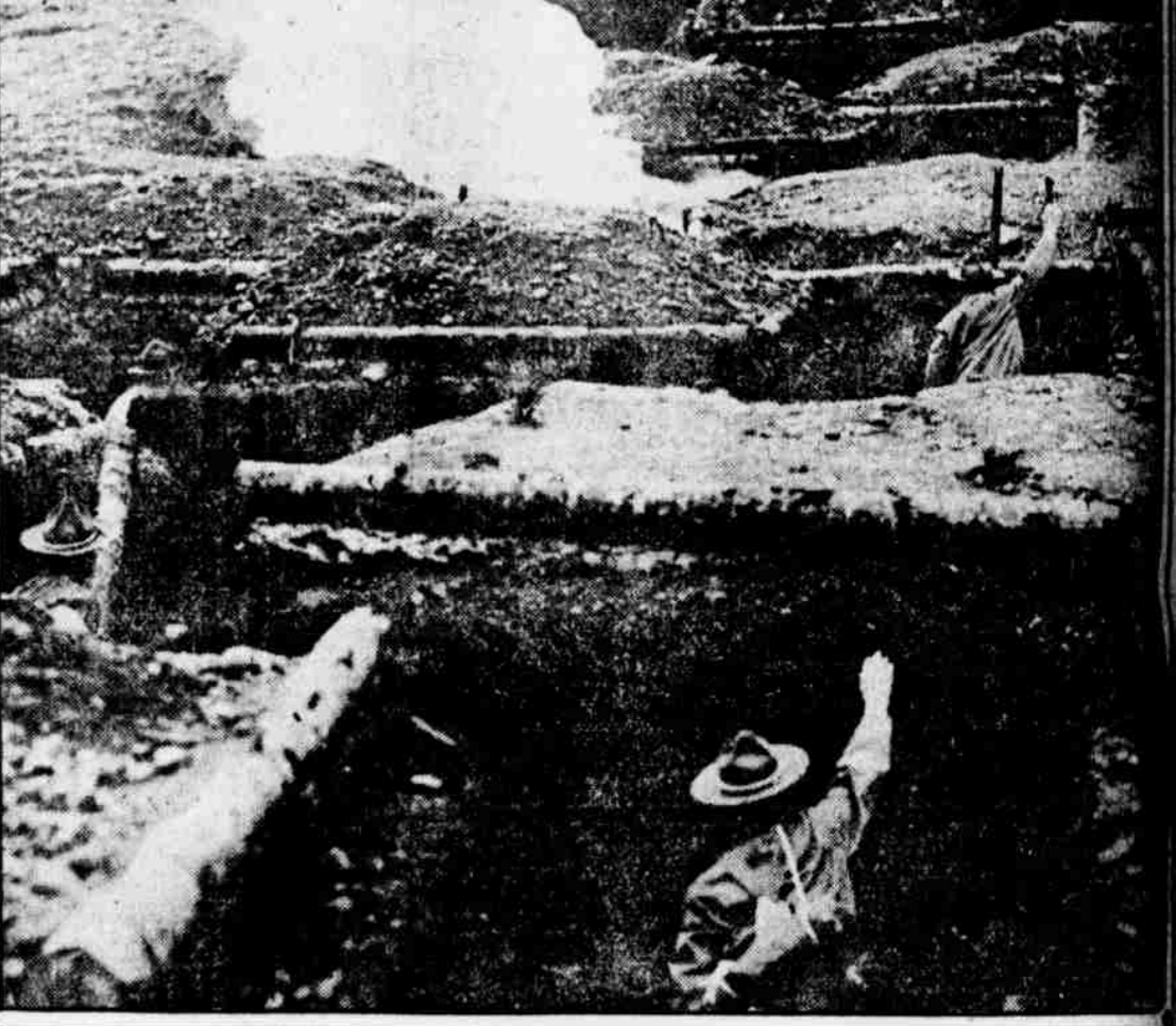
Many Times the Dispatches From the War Fronts Have Spoken of the Work of "Mopping Up the Trenches." Here You Have American Soldiers Performing That Very Operation by Exploding Bombs in the Nooks and Corners of the Trenches They Have Just "Captured," Lest Some Lurking "Foe" Remain Alive.