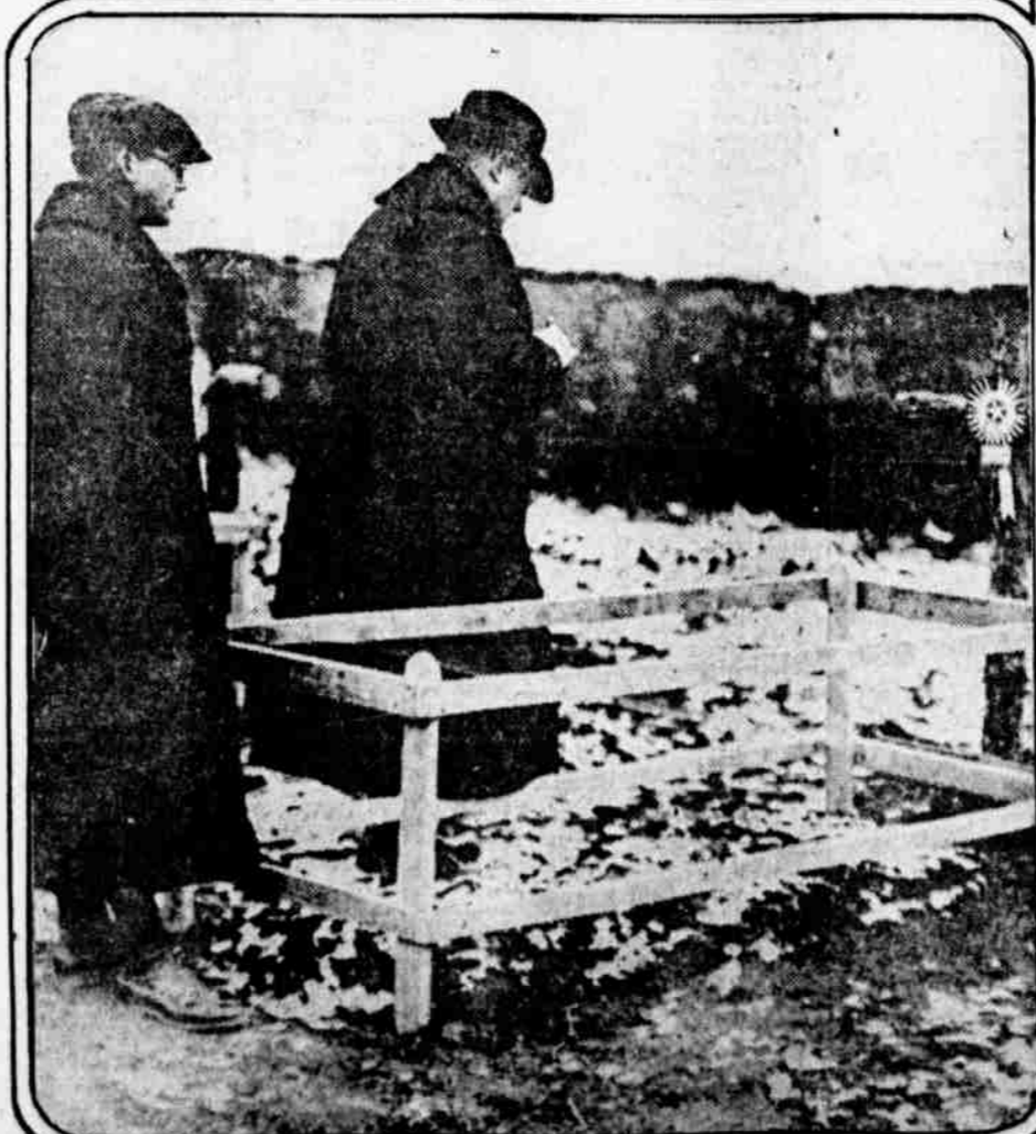
Just Outside the Ruined Village of Bethelmont, in Lorraine, Is the Little Cemetery Where the First of Our Sammees to Die on the Battlefields of France Have Found Their Last Resting Place. Two American Newspaper Correspondents Are Viewing One of the Graves.