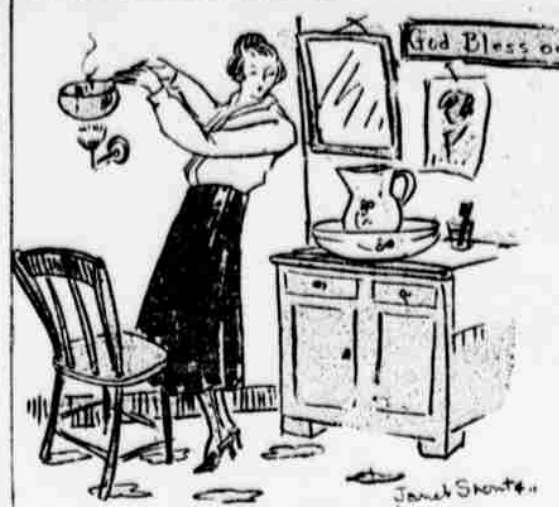
THE GIRLS WHO COOKED THEIR MORNING EGG OVER THE GAS JET ...

If You Serve Meat Tomorrow SURELY it is because you have never pictured a man at the front going hungry. Surely it is because you do not see your own little girl as the Belgian child who has gone without her dinner. IT CANNOT BE THAT YOU DO NOT CARE IF YOU SERVE MEAT TOMORROW.