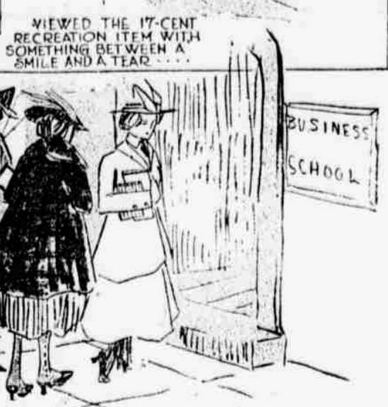
MANY HARD-WORKING GIRLS ARE STUDYING STENOGRAPHY AT NIGHT ...