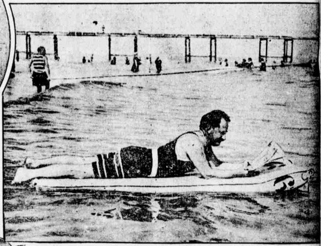
One of the reasons Samuel Untermyer has come to be known as one of America's most successful lawyers is that he never permits himself to waste a minute, even while "taking a vacation" at Palm Beach.