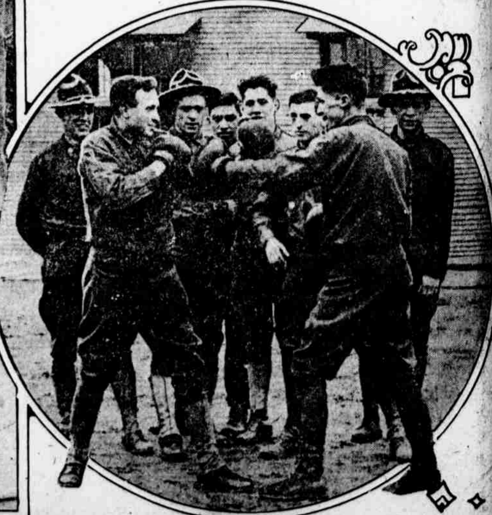
A friendly bout with the gloves never fails to draw a knot of interested onlookers at Camp Meade. The lads in the above group, by the way, are Philadelphia draftees.