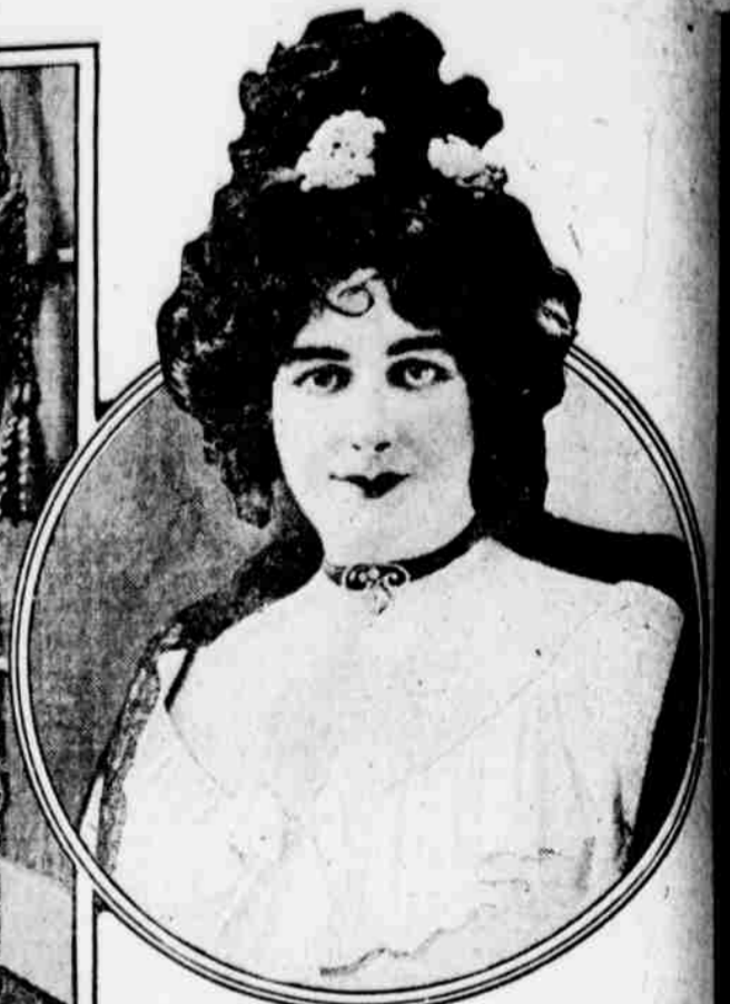
Julian Eltinge's impersonations will furnish a headliner at Keith's.