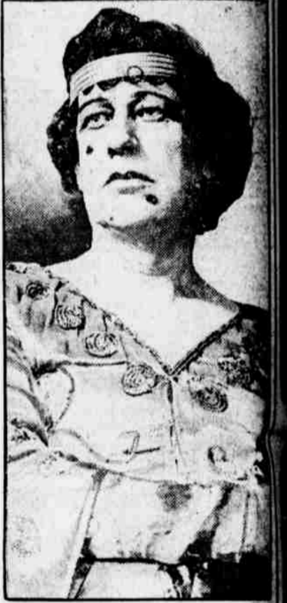
De Wolf Hopper appearing in the "Passing Show of 1917" at the Chestnut Street Opera House.