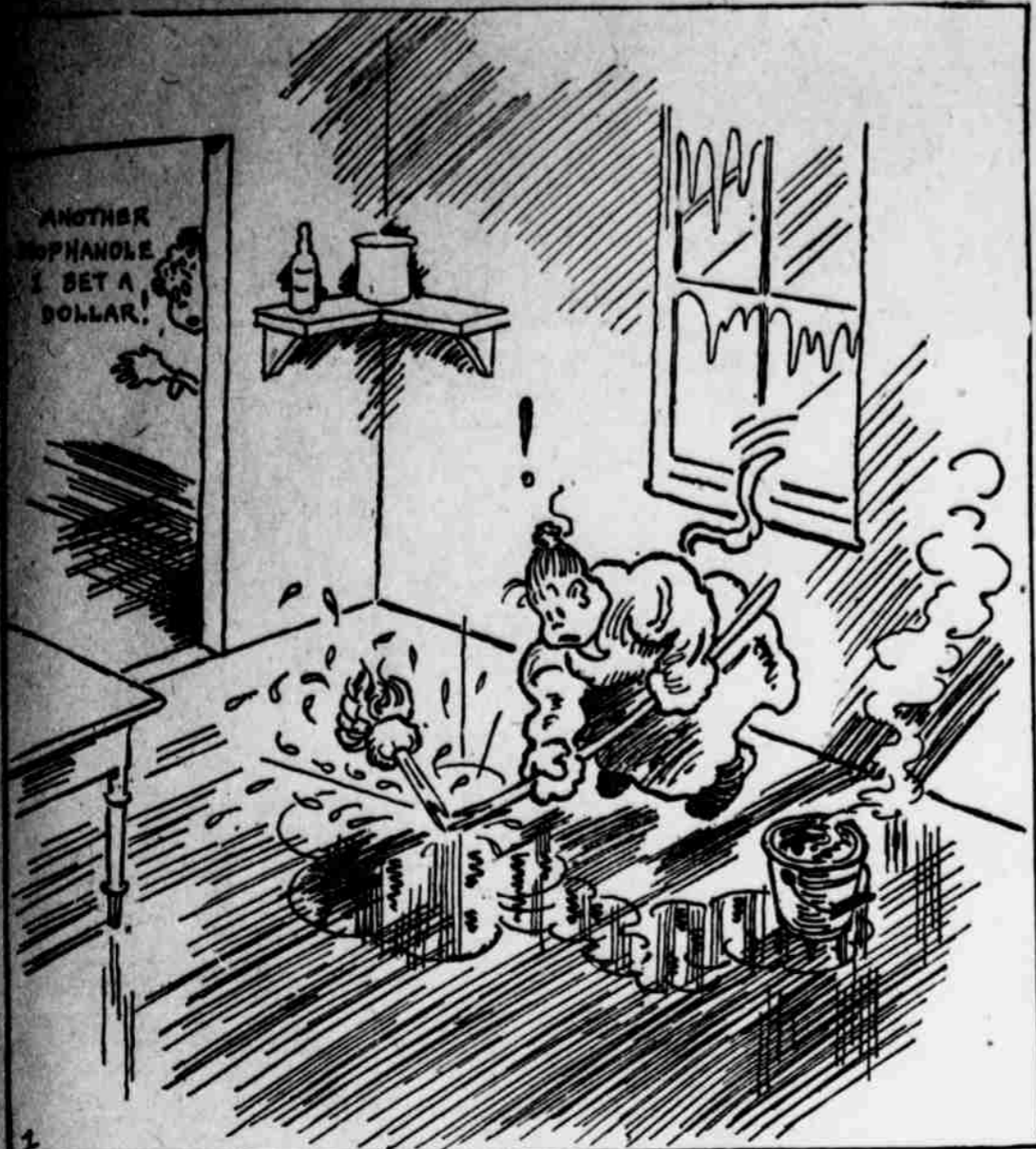
By FONTAINE FOX

WATERBURY SIMPLY WILL FORGET NOT TO PRESS DOWN TOO HARD ON MOP HANDLES