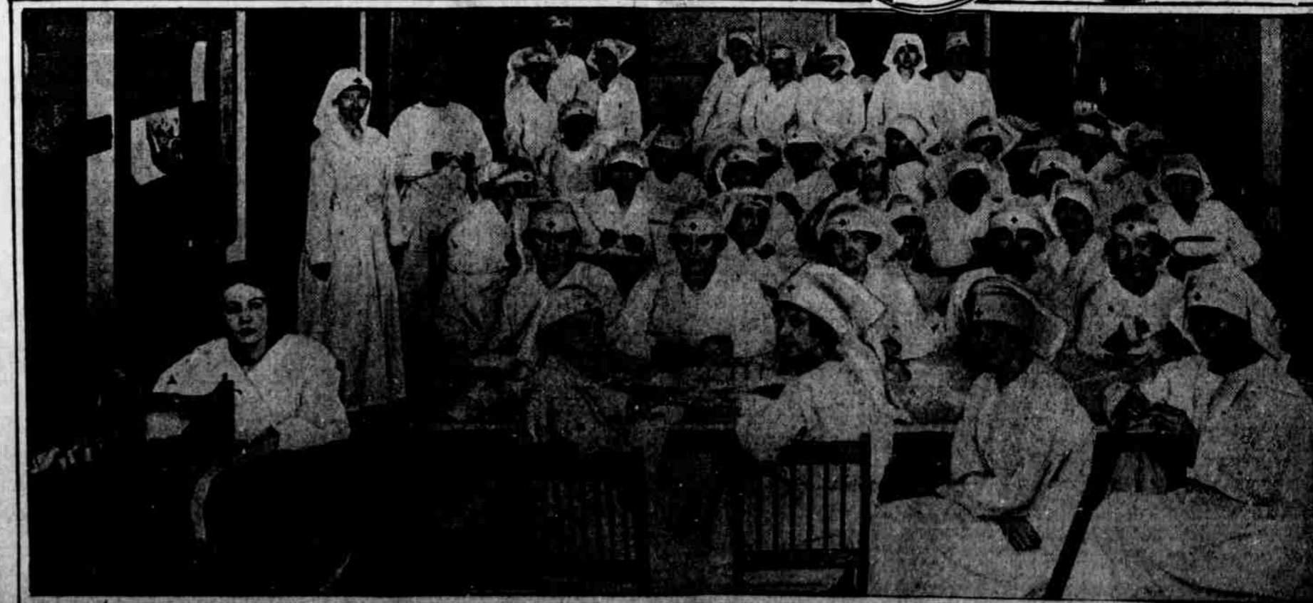
Every Wednesday evening this class of Red Cross workers, composed of employees of the Curtis Publishing Company, meets at the headquarters of the Washington Square Auxiliary, at 608 Chestnut street. Another class of Curtis Publishing Company employees meets Thursday nights.