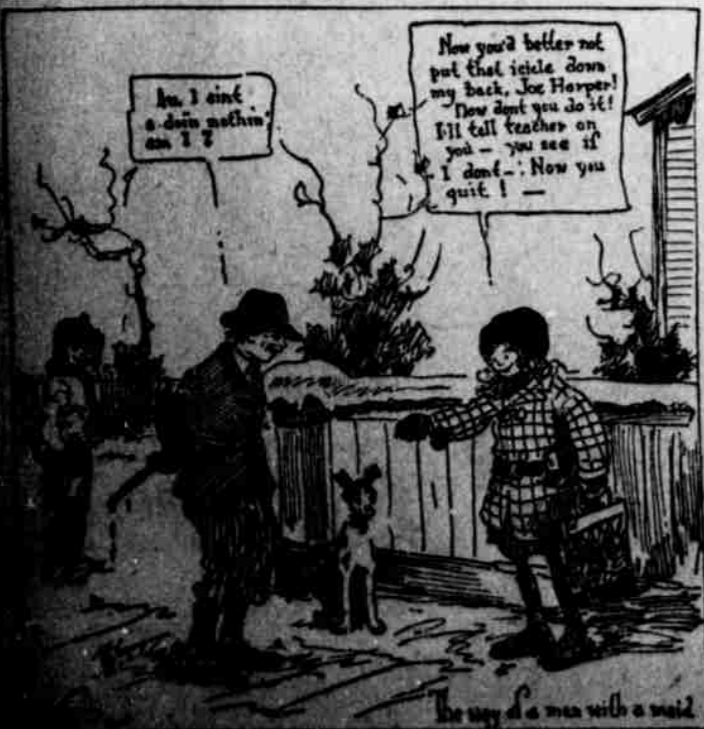
The way of a man with a maid