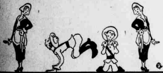
ASKING FOR RABBIT AT THE CAFE