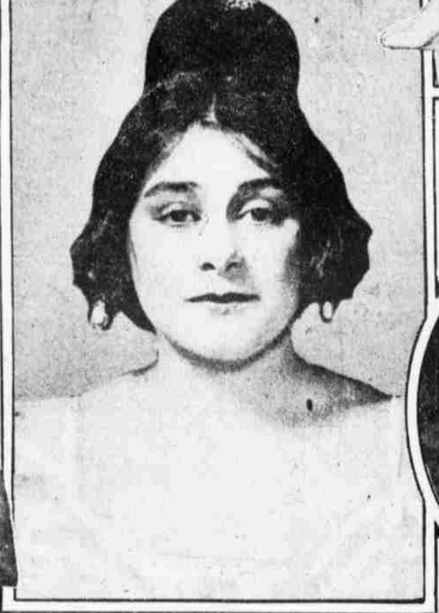
Irone Franklin as she appears in "The Passing Show of 1917" at the Chestnut Street Opera House.