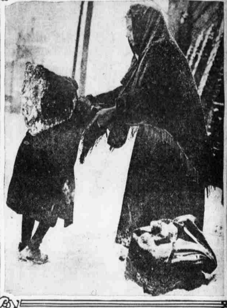
A STUDY IN FILIAL HELPFULNESS One of the touching sidelights of the fuel famine brought to light by yesterday's snowstorm.