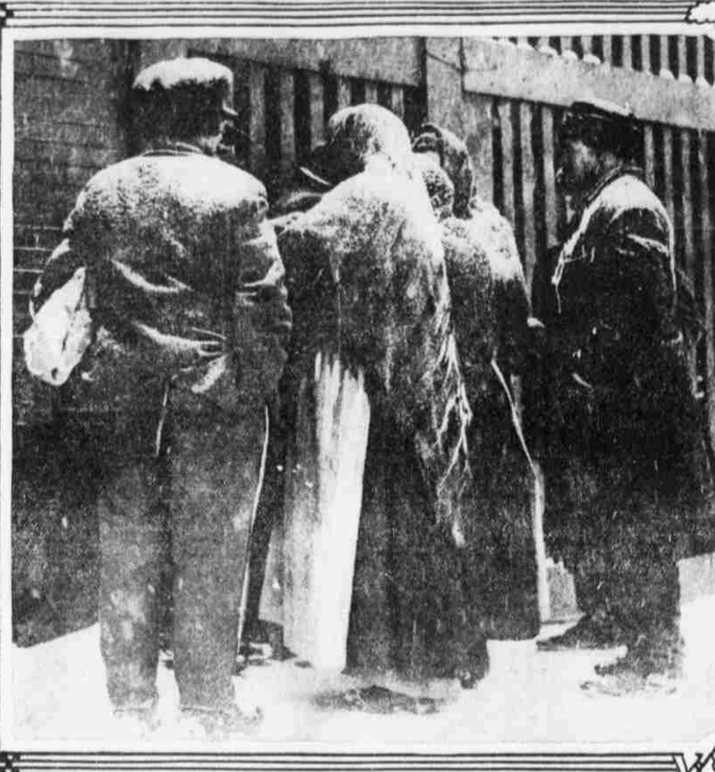
A PATHETIC SCENE, THIS Needy householders find the gates locked at the one coal yard where hitherto they had been able to purchase fuel.