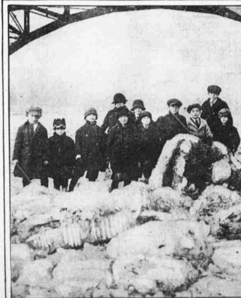
The banks of the upper Schuylkill, piled high with fantastic heaps of ice, form an alluring playground for the youngsters of the section.