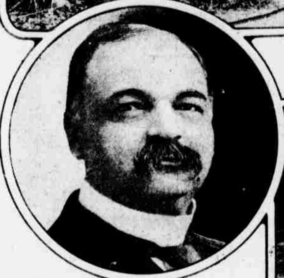
Senator Charles Curtis, of Kansas, who advocates that the Government help its enlisted men purchase farms when the war ends.