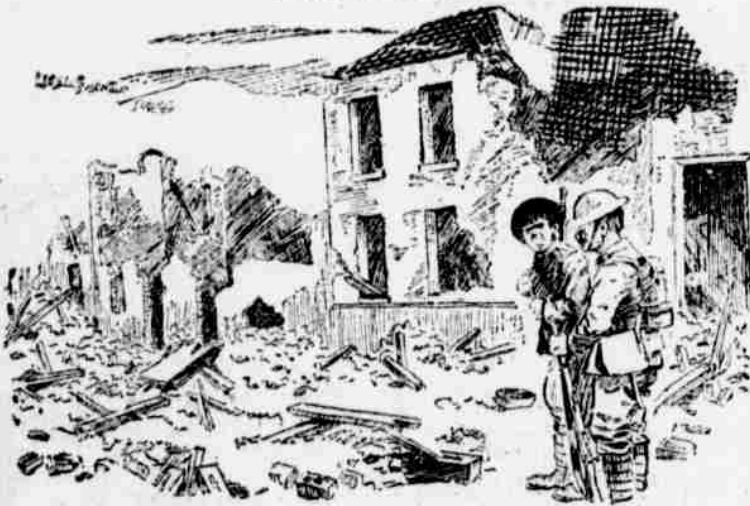
—London Opinion. "I likes this 'ere village a deuce of a lot better 'nor the last one, Jim."