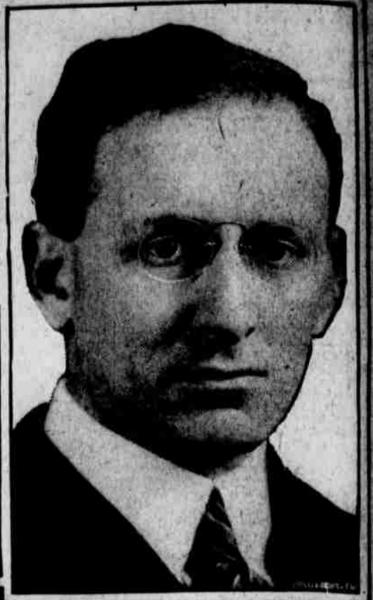
Henry Morgenthau, Jr., son of the former American Ambassador to Turkey, is head of the commission which is taking 15,000 tractors to France, with the idea of plowing up a million acres of ground.