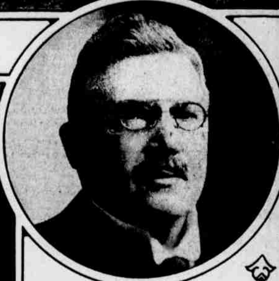
For Two Months Dr. J. Ignatius, Commissioner From the New Republic of Finland, Has Been Working in Washington With the Double Purpose of Obtaining Foodstuffs From America for the Relief of His Countrymen and to Achieve the Recognition of the New Republic by the United States.