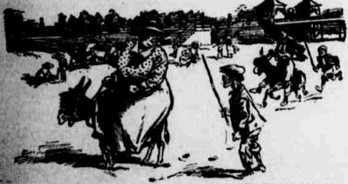
Do you mind gettin' a bit further forrard, mum, so's I can git a good "whack at 'im?" —Lassell's Saturday Journal.