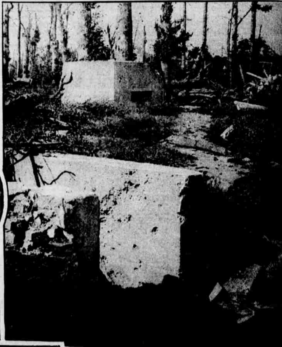
This Concrete Pillbox Represents Another German Trick When Failed to Refuel the British Artillerymen in France. It Was Erected in the Park Surrounding a Chateau, but Despite Its Clever Situation, Was Discovered and Shattered by British Gunners. In the Foreground Is the Entrance to the Pillbox.