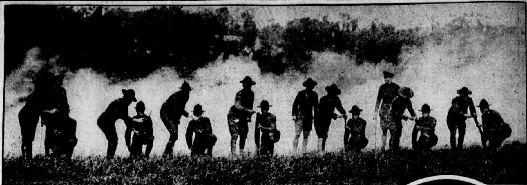
American Army Officers Learning the Ropes of the War Game at One of the British Corps Schools in France. After Completing Their Training in Bayonet Work, Hand Grenade and Bomb Throwing, the Graduate Officers in Turn Impart Their Knowledge to the Rank and File of Sammees