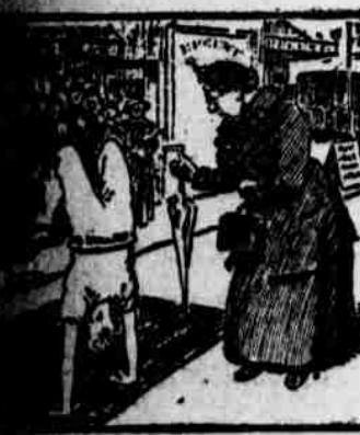
Dear old lady—Can you show me the way to the railroad station?