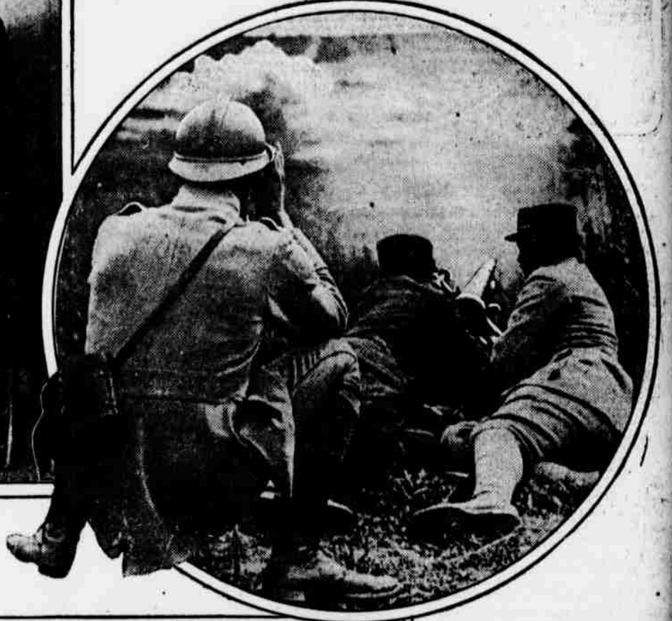
French Gunners Exchanging "Compliments" With a German Light Battery Across "No Man's Land." Note the Explosion of a Shell Directly in Front of the French Crew, Showing That the Huns Are Dangerously Close to Having the Range.