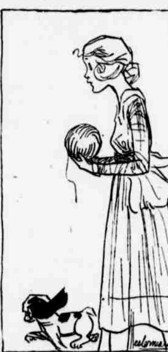
The young lady across the way says the fats are another thing that must be conserved and so her mother has told the cook to fry everything in butter until the war's over.