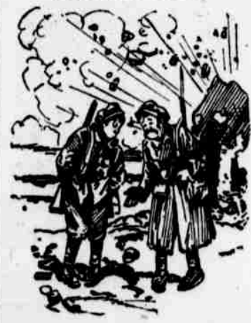
—The Tattler. "Wot do them generals 'ave all the brass on their 'ats for?" "So as they shan't be took for officers, er course."