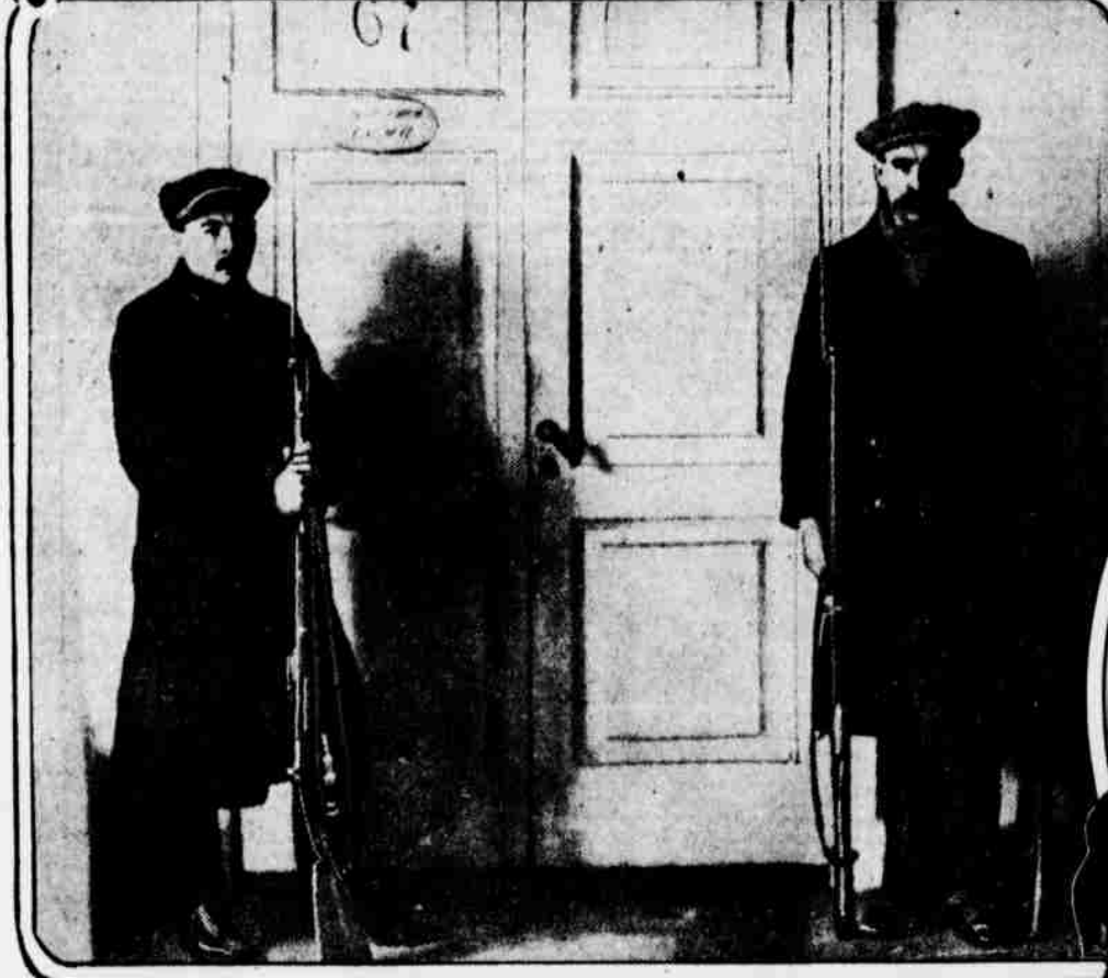
Russian Workmen Guarding With Fixed Bayonets the Door to the Room Occupied by Nicolai Lenin, Bolshevik Premier, at the "Reds'" Headquarters in Petrograd. This Photograph Strikingly Illustrates the Present Subserviency of the Russian Military to the Civilian Rule, Which Even Has Dispensed With Uniforms Among the Soldiers.