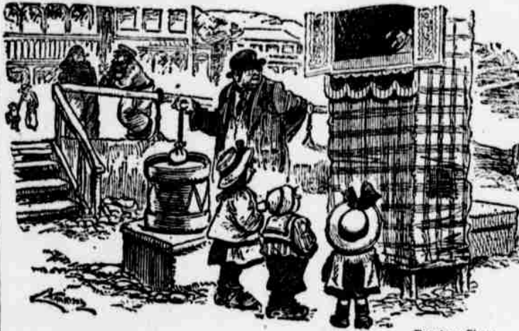
Showman—(inside show, to mate)—Any good startin' now, Bill? Bill—Not yet, there's only three dead 'ends in the stalls!