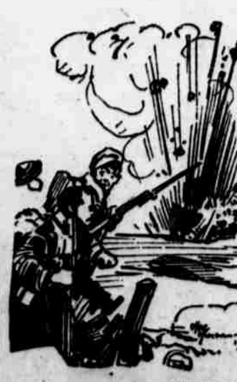
—The Sketch. "Did that cure for deafness do you any good?" "Father! I hadn't heard a word for three months, and the day after I took that medicine I heard from my brother in Blighty!"