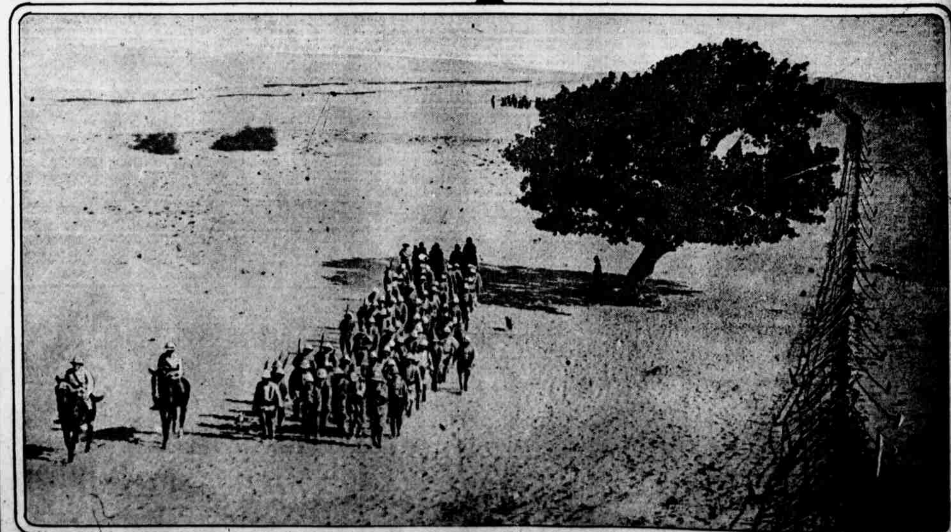
Remarkable Photograph Taken on the Deserts of Palestine, Showing a Company of French Soldiers, Who Are Operating With General Allenby's British Army, Returning to Their Camp After Doing Patrol Duty Near Jerusalem. Note the Barbed Wire Entanglements on the Right of the Picture.