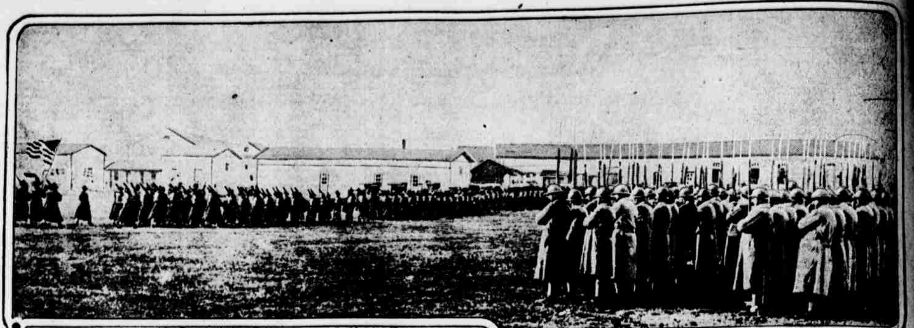
A Battalion of French Soldiers Standing at Attention While a Column of Sammees Marches Into Its Cantonment "Somewhere in France," Symbolizing the New Comradeship in Arms of the Great Sister Republics.