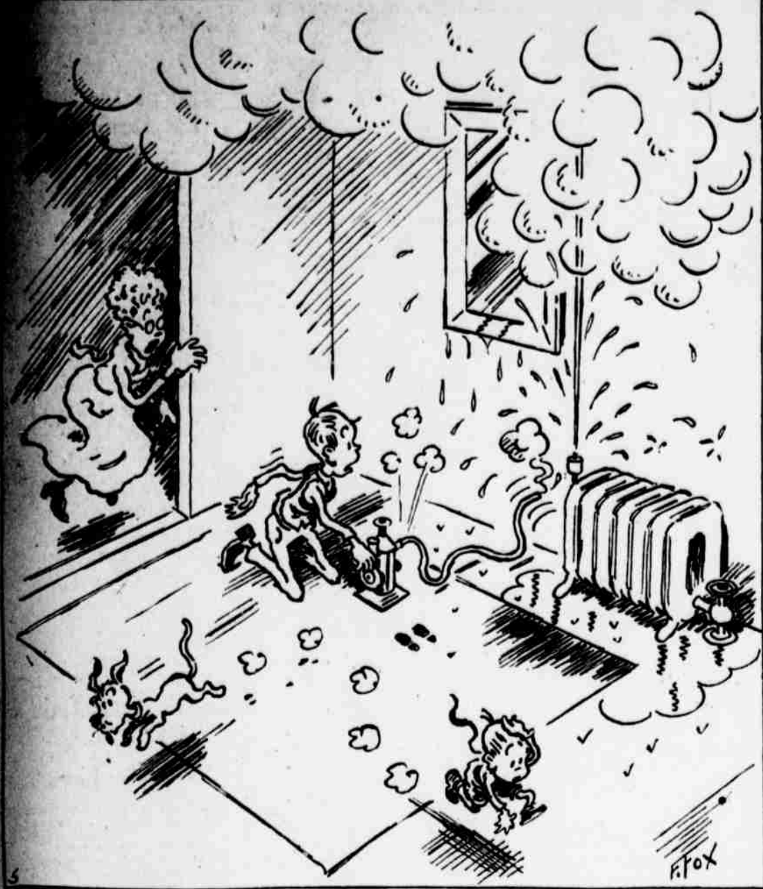
By FONTAINE FOX

MCNUTT TRIES TO RUN LITTLE WILLIE'S STEAM ENGINE WITH POWER FROM THE RADIATOR