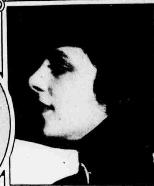
Irene Bordoni, Playing With Raymond Hitchcock in "Hitchy-Koo"—Lyric