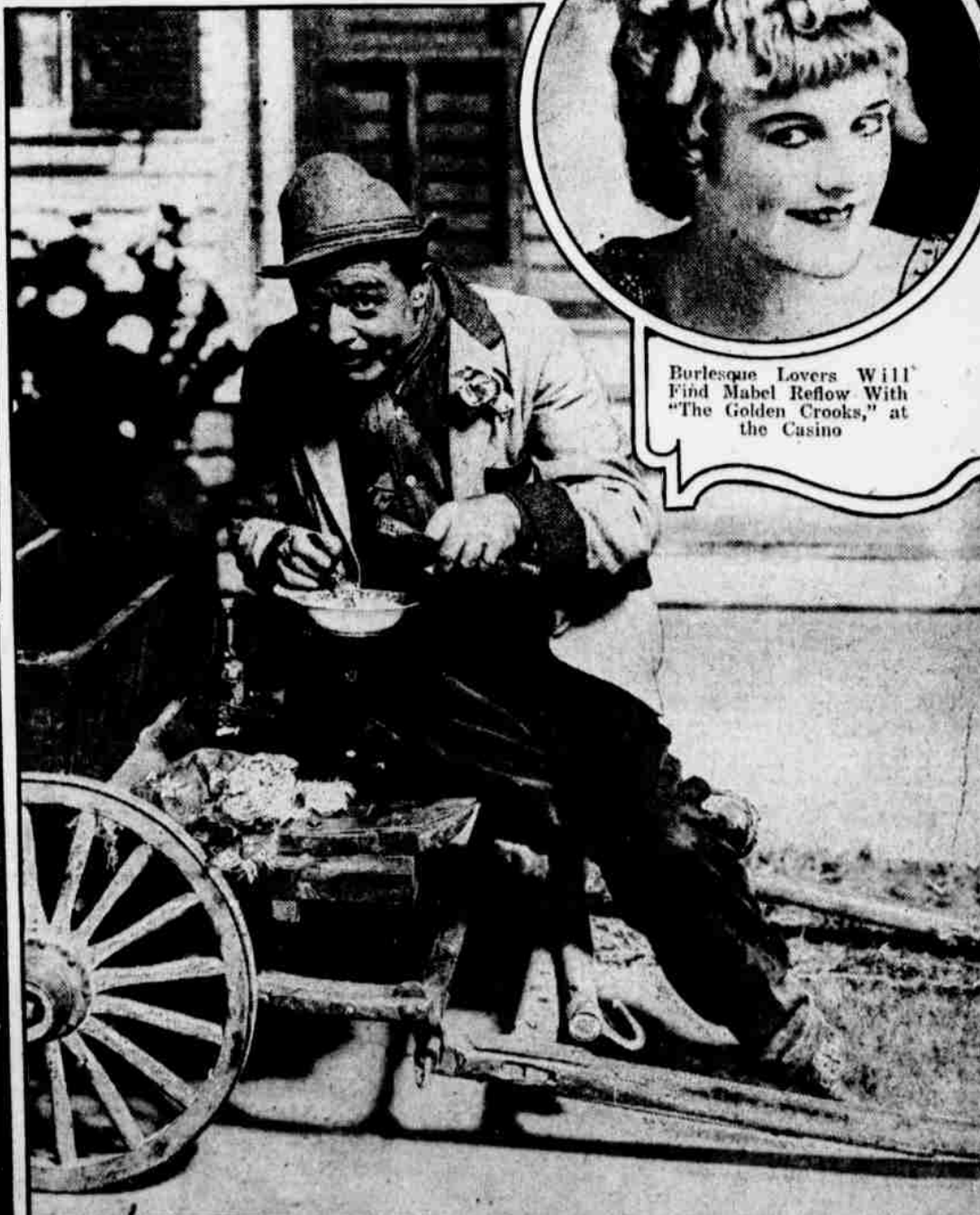
Otis Skinner as He Will Appear in "Miser Antonio," at the Broad