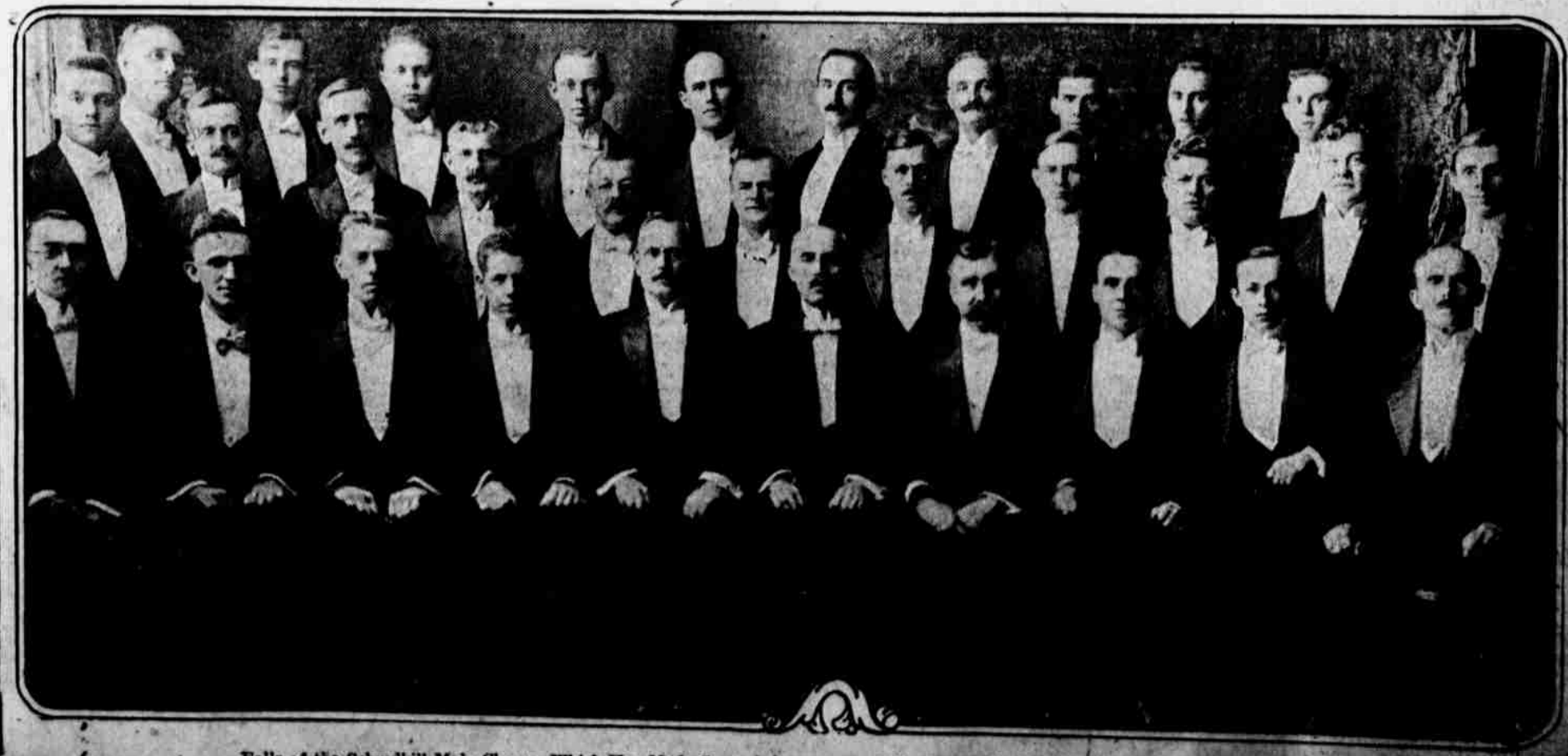
Falls of the Schuylkill Male Chorus, Which Has Made Several Appearances This Season for Patriotic Funds and Worthy Charities.