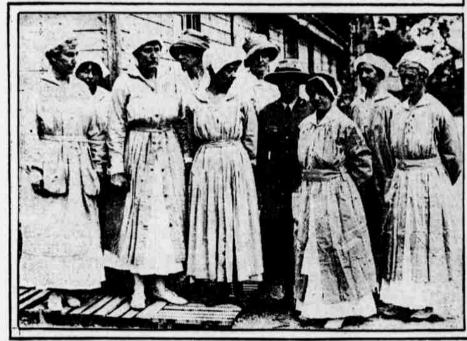
Members of the Committee of American Aid for French Wounded, Who, Under the Supervision of Miss Anne Morgan, Are Providing Shelter and Clothing for Inhabitants of Portions of France Recaptured from the Germans.