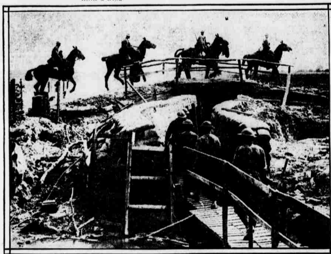
British Cavalry Crossing a Trench in Flanders by Means of a Road Thrown Across the Defensive System. Since the Battle of Cambrai Horsemen Have Again Come to Be Regarded as Essential in Modern Warfare.