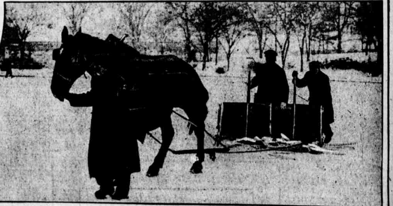
Clearing Away the Snow From Gustine Lake in Fairmount Park for the Crowd of Holiday Skaters, Who Will Enjoy the Splendid Skating There, as Well as on the Other Park Lakes and Wissahickon Creek.