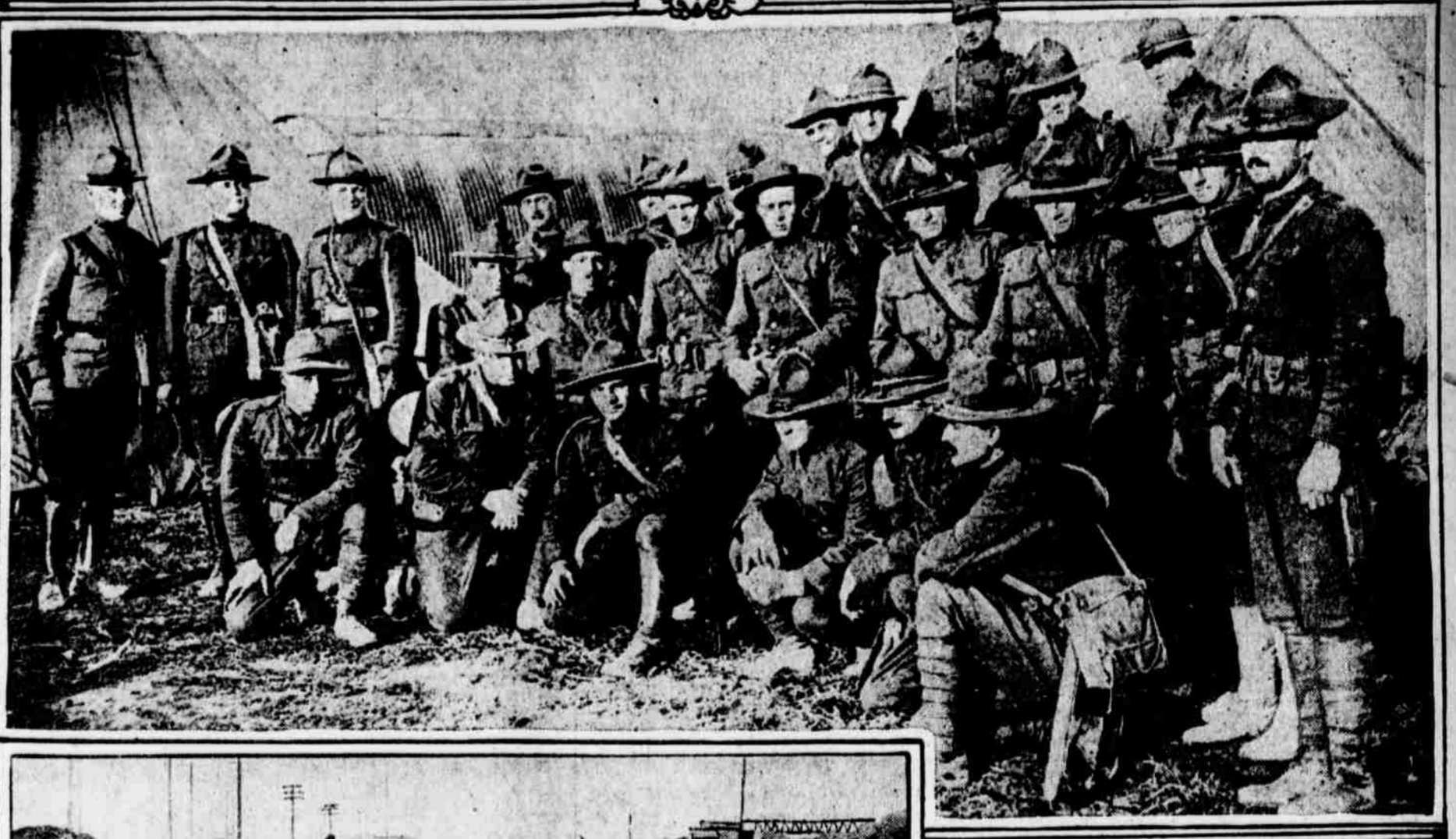
AMERICAN SOLDIERS WHO SURVIVED THE BATTLE OF CAMBRAI, WHICH, WHEN SUDDENLY SURROUNDED BY THE GERMANS IN A COUNTER-OFFENSIVE, THEY DROPPED PICK AND SHOVEL TO COMBAT THE HUNS UNTIL BRITISH RE-ENFORCEMENTS ARRIVED.

Now dearie, this is New Year's Day and I want you to make some good resolutions and KEEP them. I want you to think why being so impudent, eating cookies between meals, playing hooky from school, going to bed playing hooky from school, going to bed with a witch's face, reading fiction and novels, putting your teeth in my candy, and any thing else you should do.