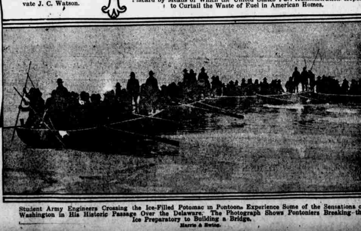
Student Army Engineers Crossing the Ice-Filled Potomac in Pontoons Experience Some of the Sensations of Washington in His Historic Passage Over the Delaware. The Photograph Shows Pontooners Breaking the Ice Preparatory to Building a Bridge.

Placard by Means of Which the United States Fuel Administration Hopes to Curtail the Waste of Fuel in American Homes.