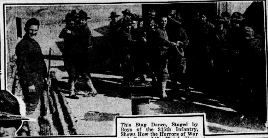
This Stag Dance, Staged by Boys of the 315th Infantry, Shows How the Horrors of War and Camp Life Weigh Upon the Drafted Men From Pennsylvania.