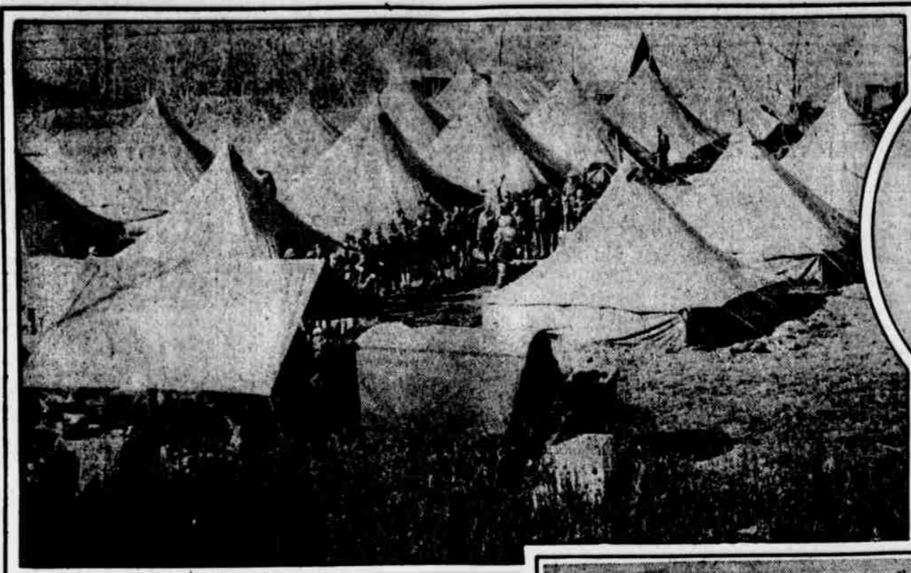
Mess Time at the Supply Tents for the 2000 Ambulance Corps Men Who Hiked Four Miles From Headquarters at Allentown, Pa., and Dug Themselves in in True War Fashion.