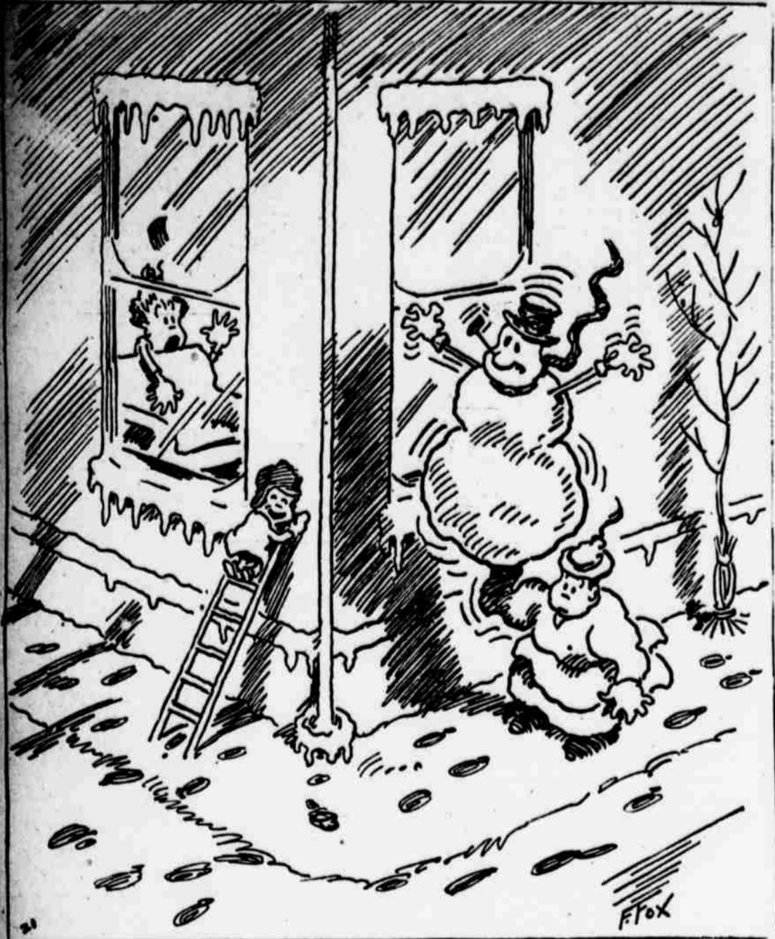
By FONTAINE FOX. (Copyright.)

IN THE AID OF THE POWERFUL KATRINKA THE BABY SCARED MOTHER HALF TO DEATH WITH HIS SNOW MAN