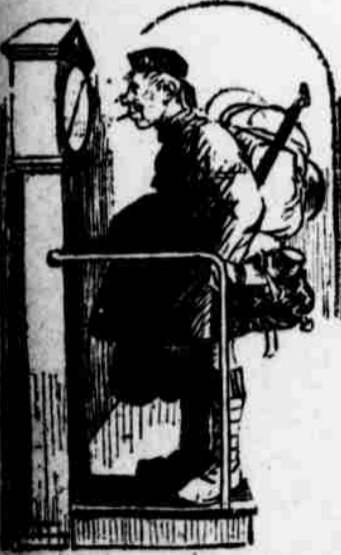
—London Opinion. "Hoots—but th' Army's the life fer me—I were nine stone when I joined up an' I'm fifteen th' now!"