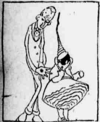
—The Lampton. "What's going to keep me from kissing you?" "My goodness!"