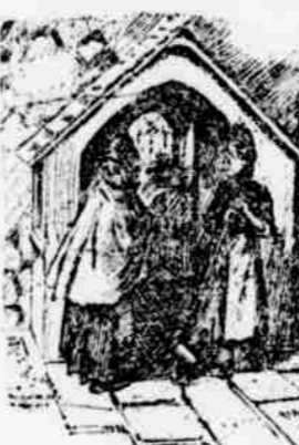
The Padded Cell

Injured Paw-Cleaner's Yes, Mr. Thompson, instead of rice all the wedding's now use that rice con-fetti. And can you make puddin' out of the con-fetti, I ask you?