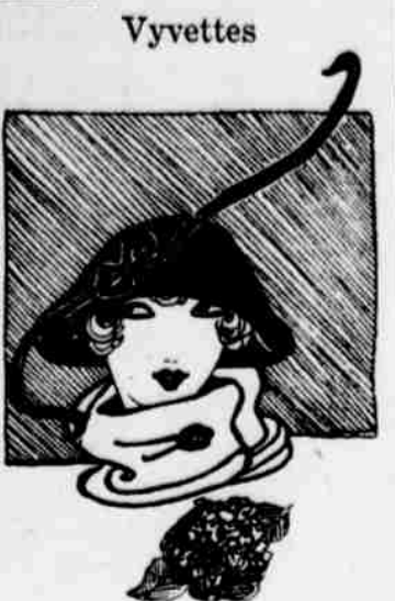
Yvettes Just a little dark slouch felt hat, turned back and a little bow, with long wired ends going northeast by southwest!