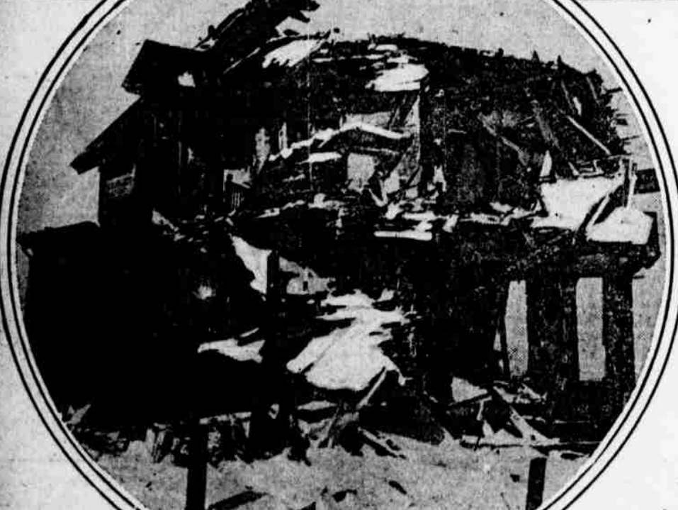
The Thayer Home in Duffas Street, Halifax, Where a Group of Women Were Watching the Burning Munition Ship in the Harbor When the Explosion Occurred. The House Caved in, but the Women in Some Miraculous Manner Escaped Serious Injury.