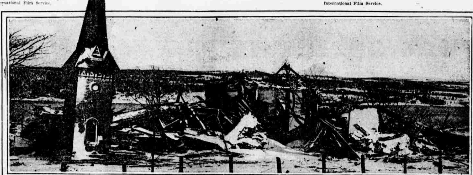
Grove Street Church in Halifax, Which Was Brought to Earth by the Terrific Concussion. By Some Freak the Steeple, Which Would Be Expected to Fall First, Remains Standing Intact.