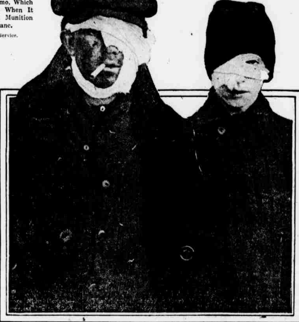
Thousands of Injured Swathed in Bandages Are a Familiar Sight in Halifax Since the Explosion. The Man on the Left Was Struck by a Falling Window. The Boy, Who Was Working in a Bakery, Was Laid Out by Flying Pots and Pans.