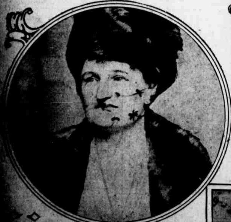
Mrs. John D. Rockefeller, Jr., Who Was Among the Guests of Honor at a War Luncheon Here Yesterday.