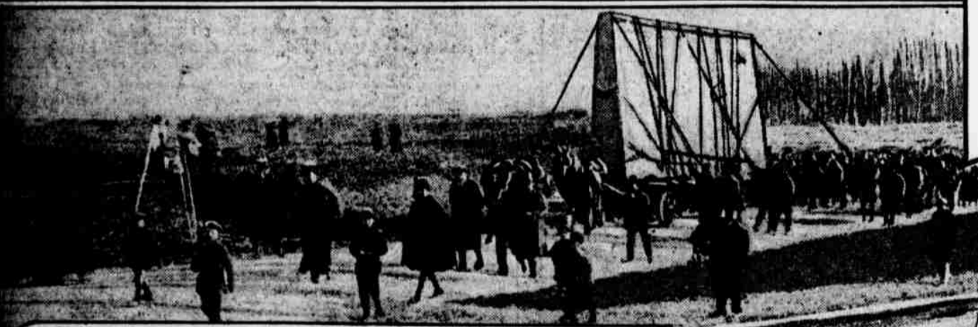
A Famous Fresco Painting, That of the Assunta, Formerly One of the Most Admired Art Treasures of Venice, is Landed "Somewhere on the Adriatic Coast" for Safe Keeping.