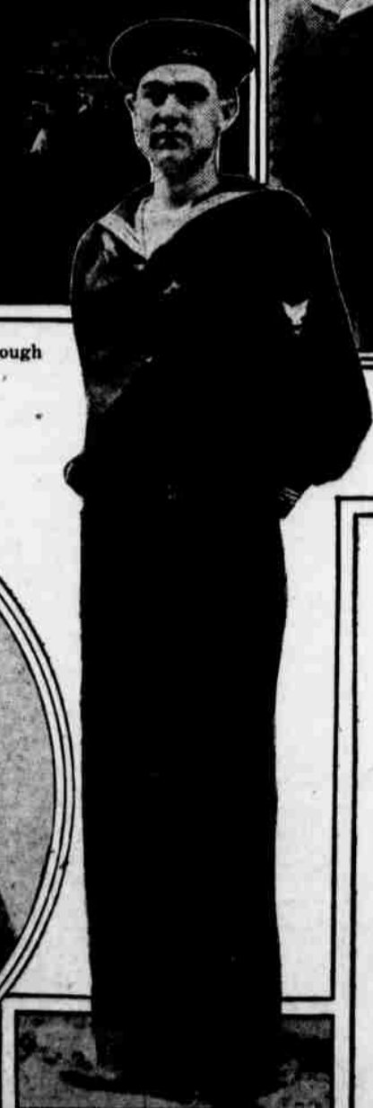
Ernie Shore, Famous Red Sox Pitcher, in His Naval Uniform.