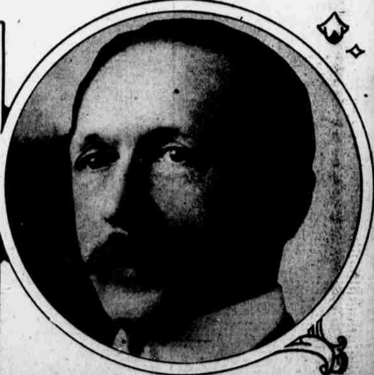
Chevalier Van Reppard, Dutch Minister to the United States, Who Has Been Recalled From Washington for Some Reason Touching the Dutch-American Export Negotiations.