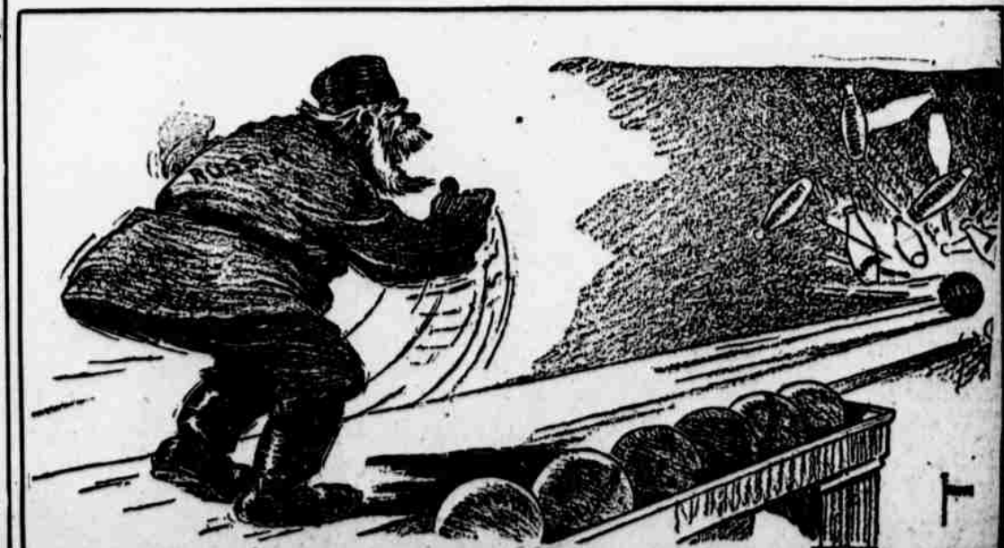
SET 'EM UP AGAIN Brown, in Chicago News.