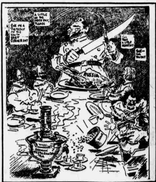
LET US HAVE PEACE Chapin, in St. Louis Republic.