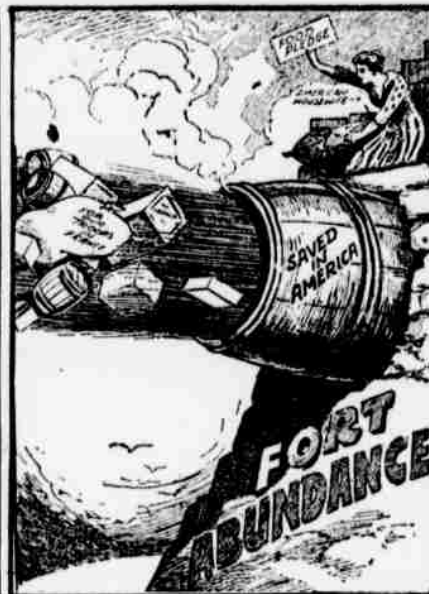
DOING HER BIT