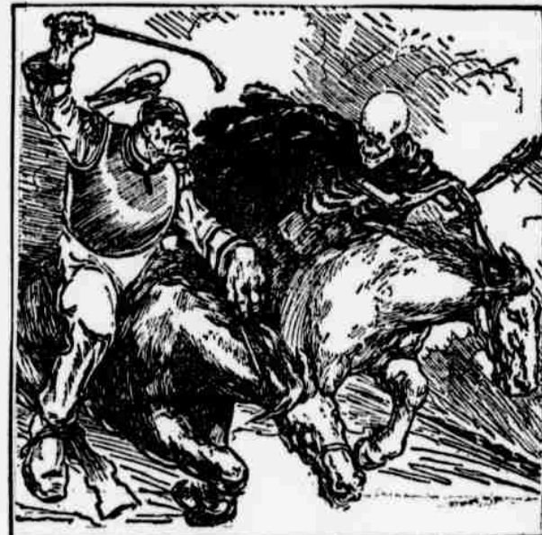
THE PACEMAKER