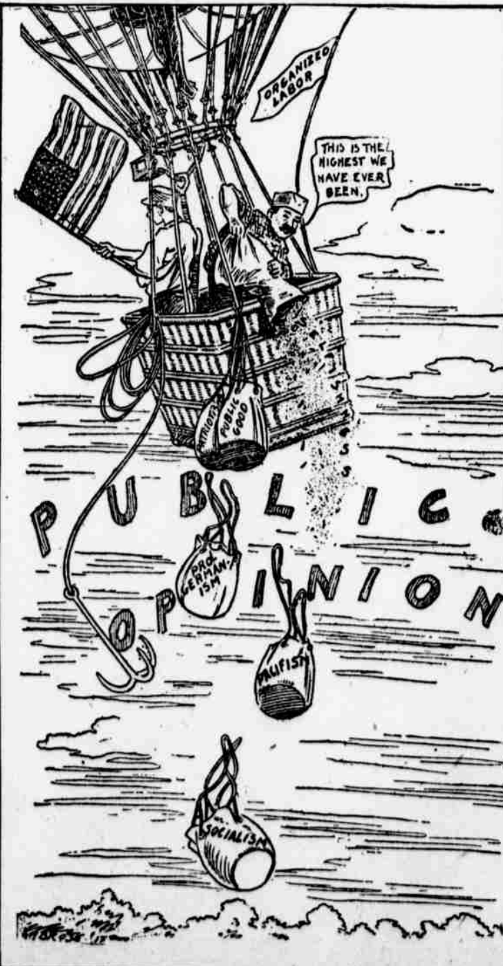
AN ALTITUDE RECORD Ambrose, in Rochester (N. Y.) Post-Express.