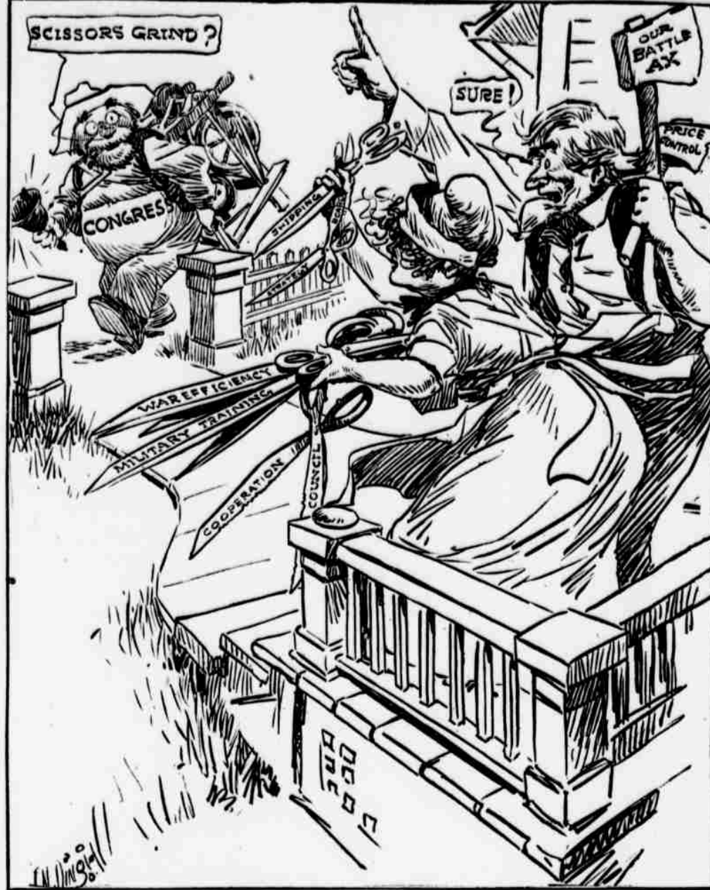
WON'T HURT TO HAVE 'EM ALL SHARPENED UP A BIT