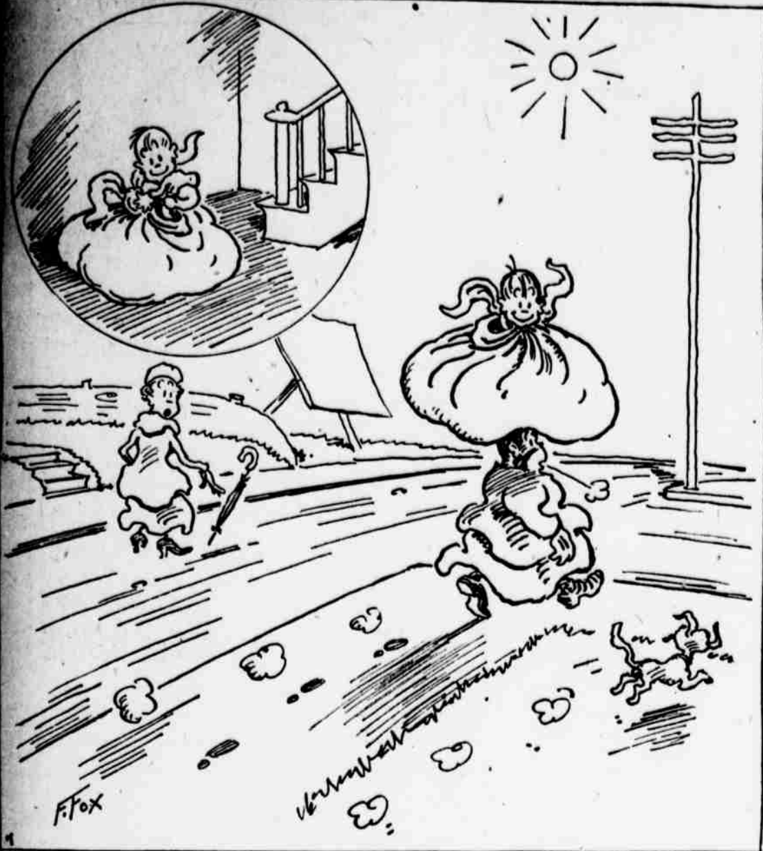
By FONTAINE FOX.

ITTLE EGBERT'S BEST STUNT LAST WEEK WAS TO HIDE IN THE SOILED CLOTHES AND RIDE ALL THE WAY TO THE WASHERWOMAN'S HOUSE