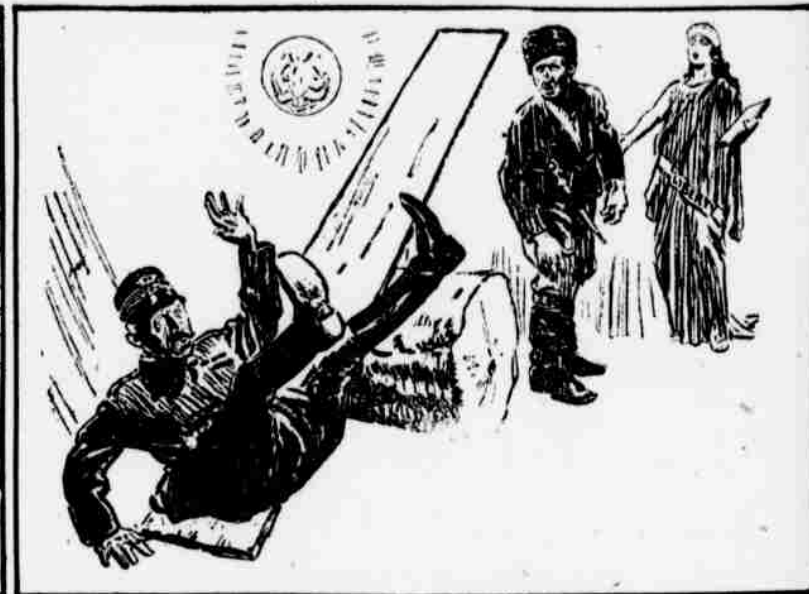
THE WAR SEE-SAW Miss Liberty (to Russia): "This isn't the way to win me. See how you have let poor Italy down!" From Opinion, London, England.