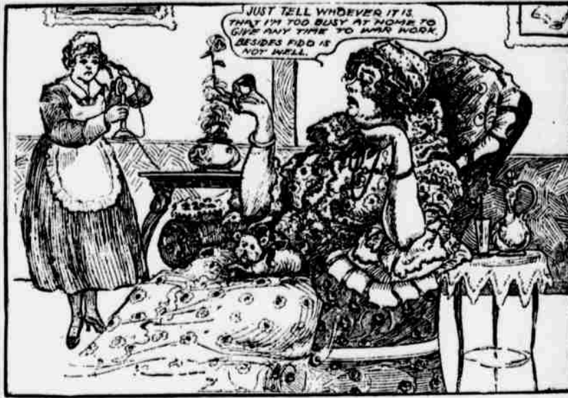
IDLE HANDS Blackman, in Birmingham (Ala.) Age-Herald.