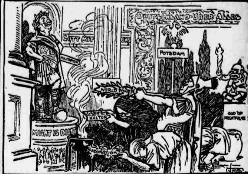
A SHRINE THAT MUST BE SMASHED From News of the World, London, England.