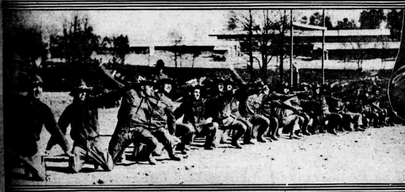
Philadelphia's Citizen Soldiers at Camp Meade Learning How to Throw Hand Grenades and Bombs With Deadly Accuracy.