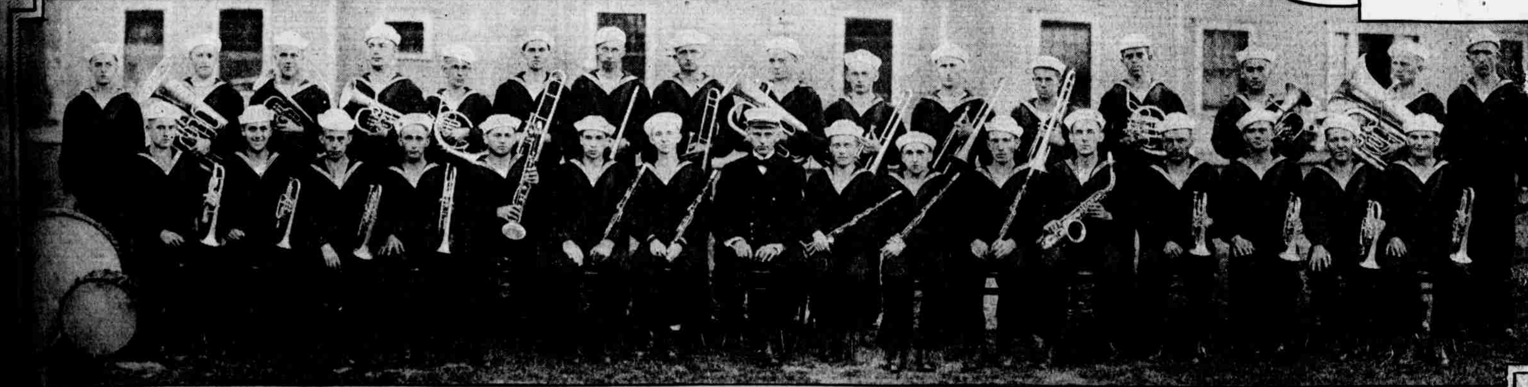
Younger Members of the Famous Repasz Band of Williamsport, Pa., a Veteran Organization With a Record for Service Through the Civil and Spanish-American Wars, Who Have Upheld Tradition by Enlisting in the "Blue Jacket" Naval Band, Stationed at Pelham Bay, New York.