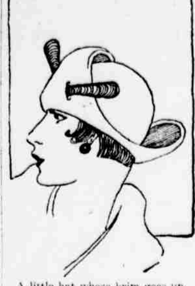
A little hat whose brim goes up in the front, down and around at the sides and up again in the back!

Their big brothers are going many a shirt that needs laundering. The pity of it is it doesn't surge for sweets, and they are the new big rothers. What an investment to make Boy Scout if he goes on shouldn't be a Boy Scout if he goes on shouldn't part of the start of something fine and clean, it comes to the top. It stays there for a little while at a time, tremulously, hopefully waiting to be caught. But in most cases it lish't caught. And the little gutter chap wouldn't be a Boy Scout if he goes on shouldn't part of the stays there for a little gutter chap to cut Rowdy. The man tried to cut Rowdy with the whip, which wouldn't be a Boy Scout if he goes on shouldn't part of the stays there. That seared the horse and it immed war by the tens, by the hun- The pity of it is it doesn't surge forcouldn't be a Boy Scout if he goes on shouting "uxtry paper" and he 147 The big reason for the launch- forgets-his dream. There are many of the campaign is to be able to other things to think of cars to hitch