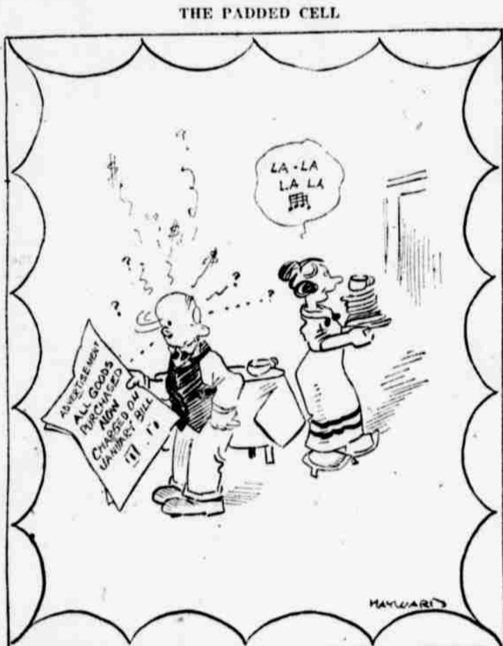
THE PADDED CELL LA-LA LA-LA Misinterpreted The lovers sat in the blissful solitude of the conservatory. It was her birthday, and the talk (she saw to that) drifted in the direction of presents, and he asked her what she would like from her own true lovey-dovey. "Something for my neck, darling, please," she cooed. He was full of good intentions, but sometimes awfully absent-minded. Thus he replied: "Yes, darling, I'll buy you a box of Paredin's cream soap."—Pearson's Weekly.