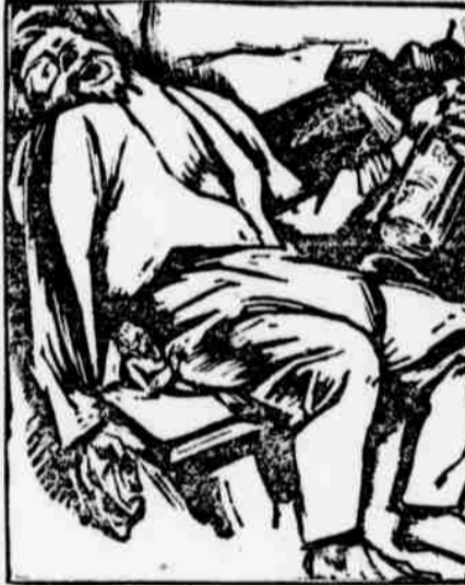
TOO MUCH VODKA From Novy Satirik, Petrograd, Russia.