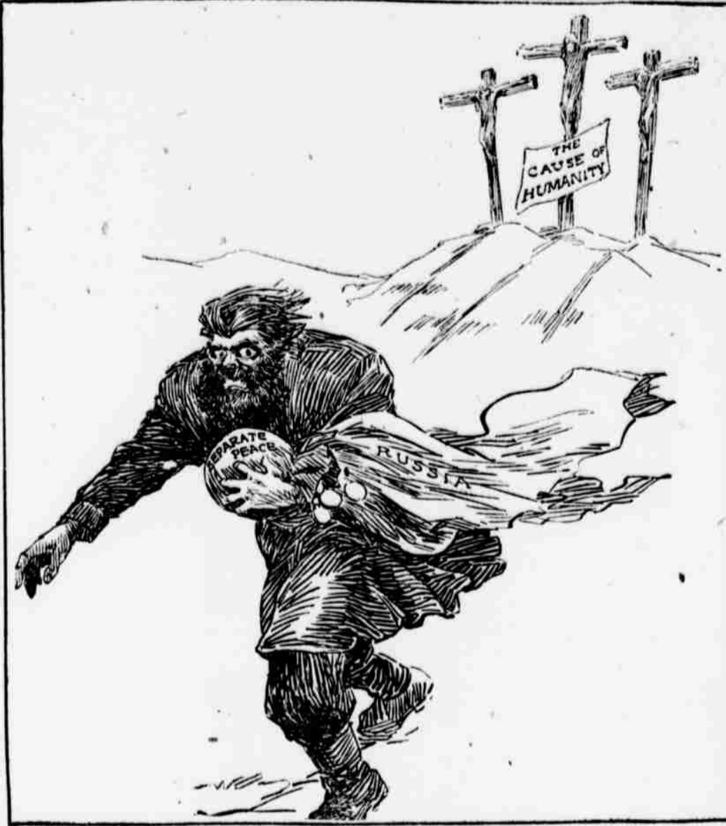
"AND ONE OF YOU SHALL BETRAY ME"