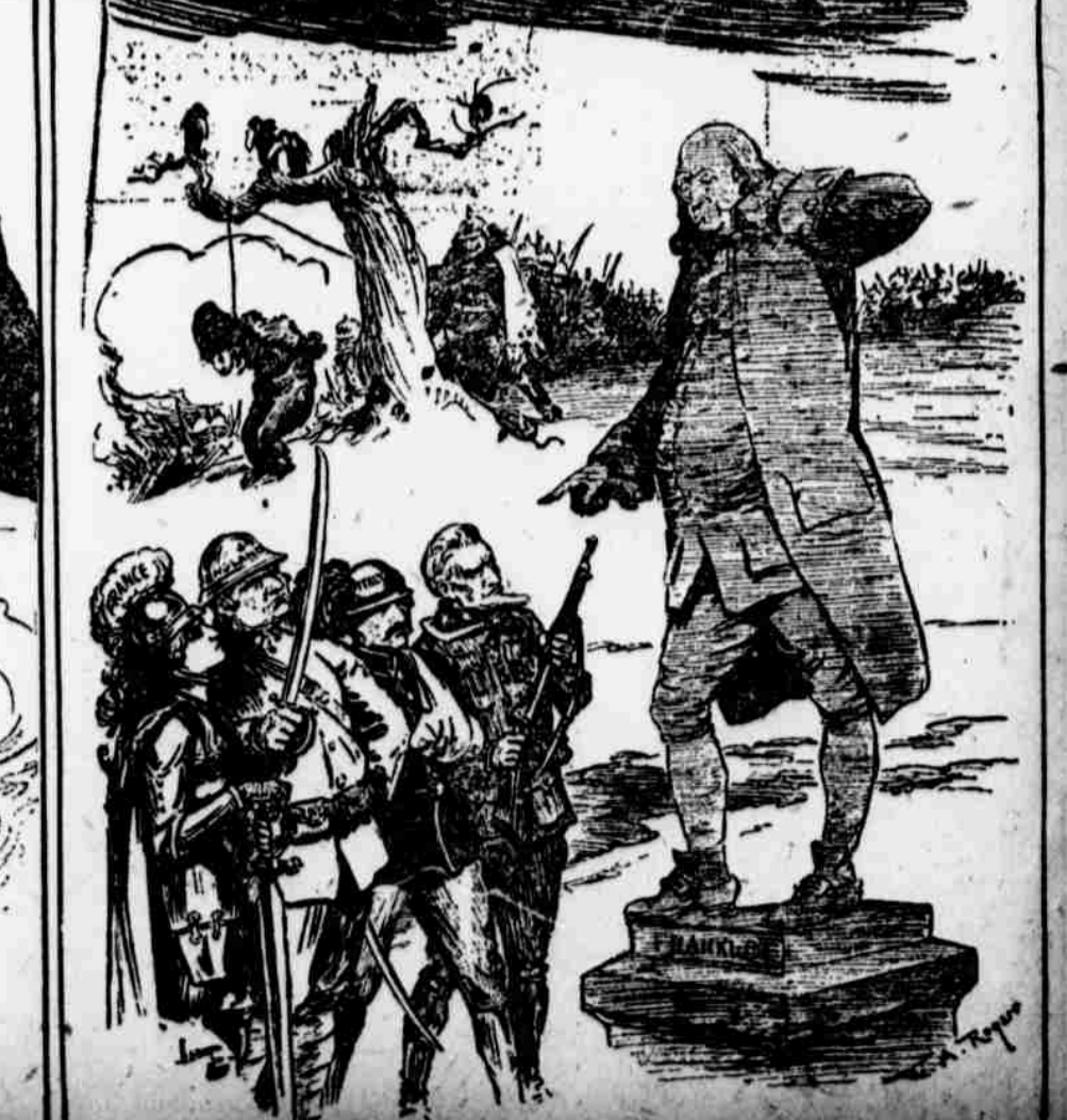
NOT LIKE MOTHER USED TO MAKE Kirby, in New York World.