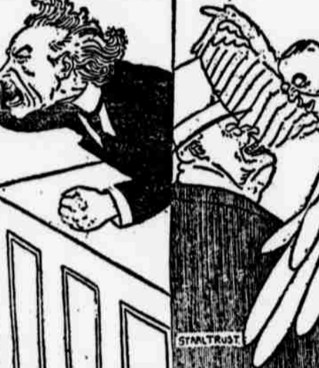
Lloyd George: About a year.