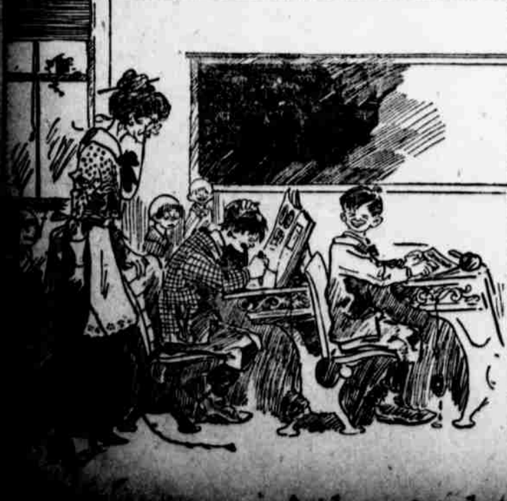
SCHOOL DAYS By DWIG "What makes you think all women hate each other?" "Because a woman so seldom brings up a son fit to be another woman's husband."—Answers. Ground for Complaint Waiter—The customers are complaining that the coffee tastes like mud. Chef—That's all right. Tell them it was ground this morning.—Answers.