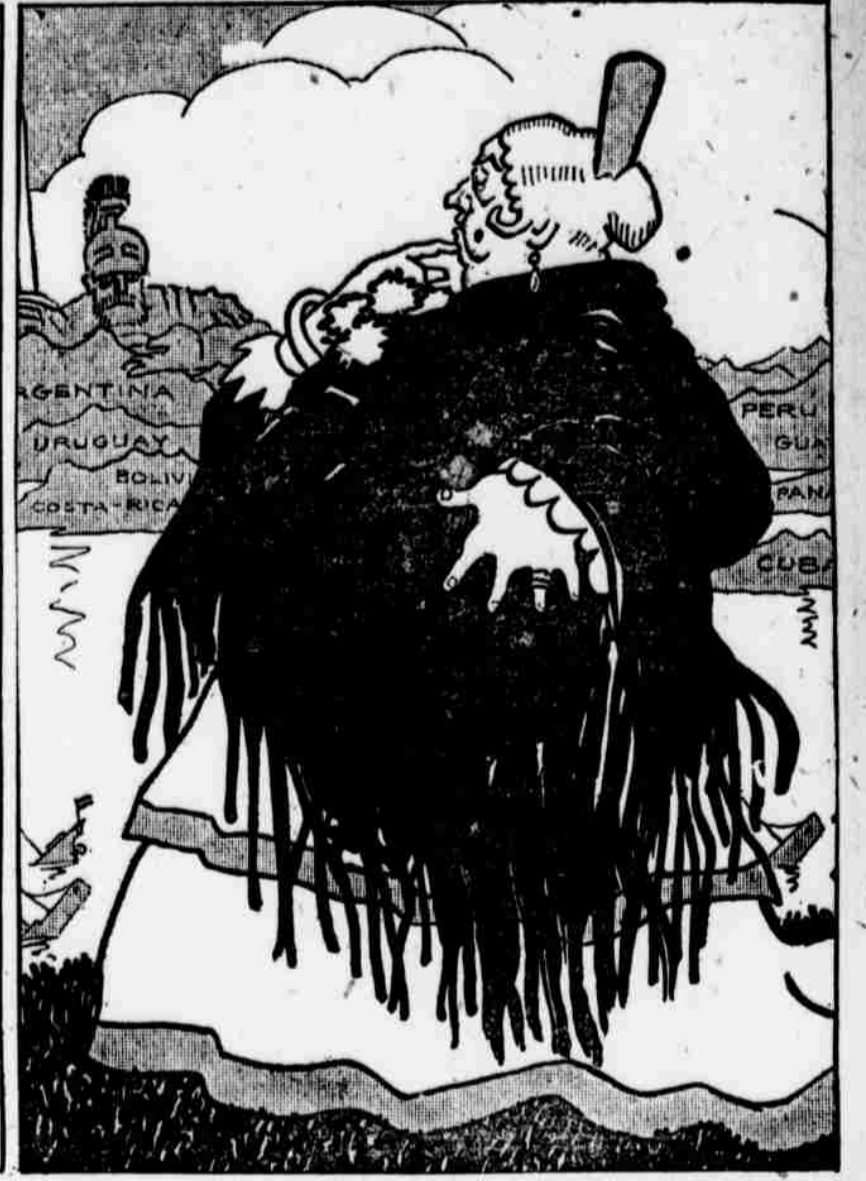
THE MARTIAL SPANIARDS Spain: "I can hardly believe that I am the mother of these children." From Esouella, Barcelona, Spain.