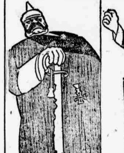
Hindenburg: About three months.