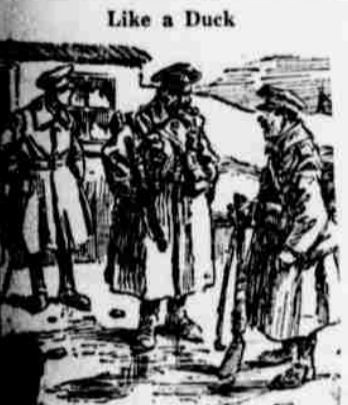
Like a Duck Tommy (after a fortnight of) "Ere, Sargent, when are they for issue us wiv web feet?"