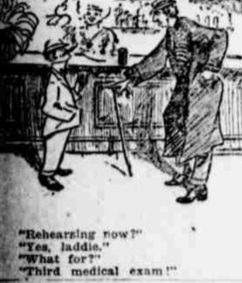
Courage "Rehearsing now?" "Yes, laddie." "What for?" "Third medical exam!"