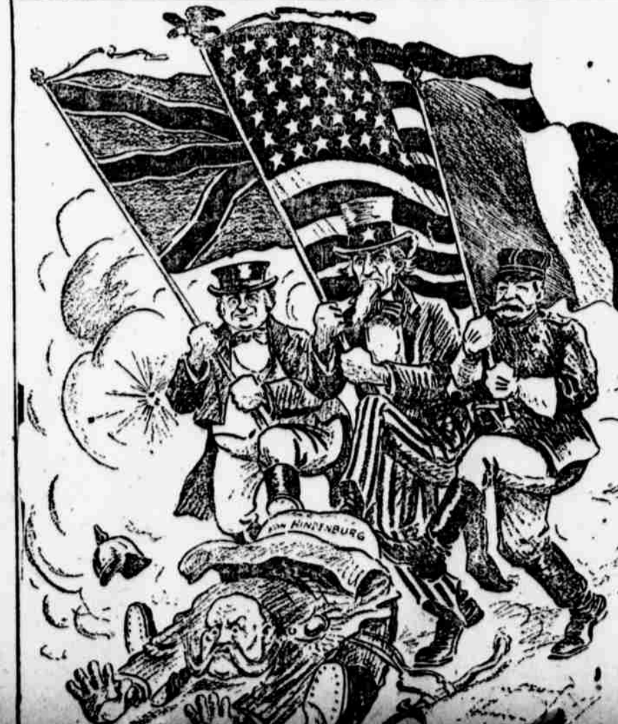
HOW LONG WILL THE WAR LAST? Hindenburg: About three months. Lloyd George: About a year. Wilson: At least three years. Norwegian: At least ten years.