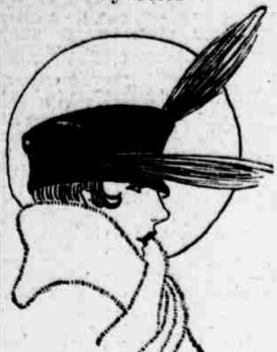
A hat of dark battleship gray, with two searchlights of white aigrettes!

see what's happening. If one of the cooks wants three pounds of butter he asks what he's going to do with it. If a bit of fat is thrown out he wants to know why. Every once in a while we find him out looking at the potato parings to see if they're thin enough. He supervises all the buying now, because he knows how to buy.