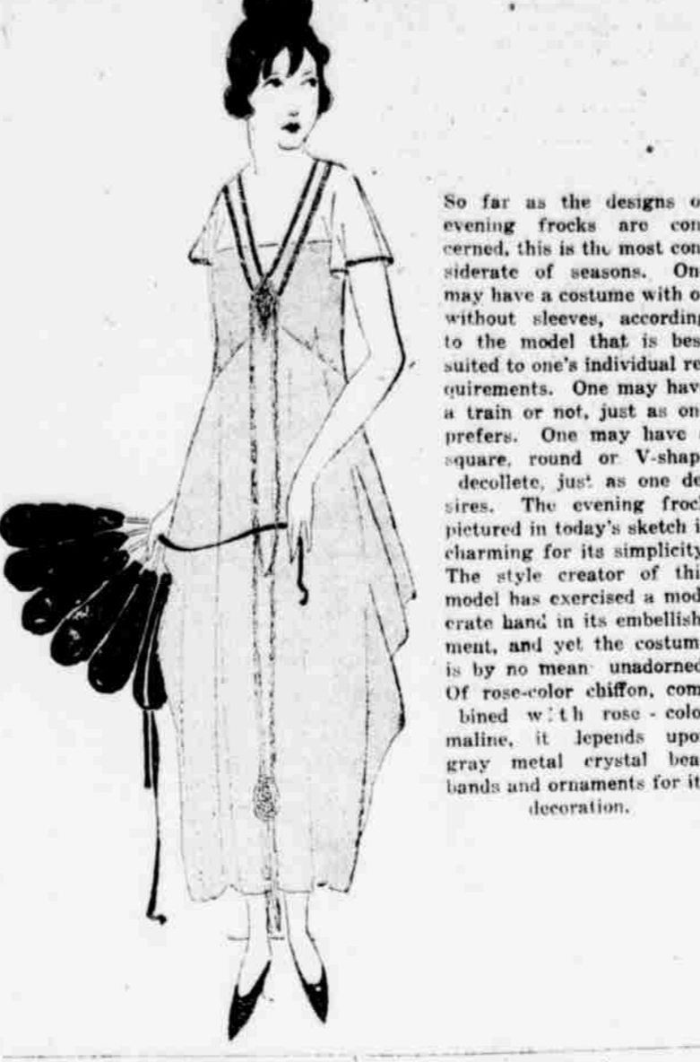
So far as the designs of evening frocks are concerned, this is the most conservative of seasons. One may have a costume with or without sleeves, according to the model that is best suited to one's individual requirements.

Evening Frock of Rose and Gray Color Scheme