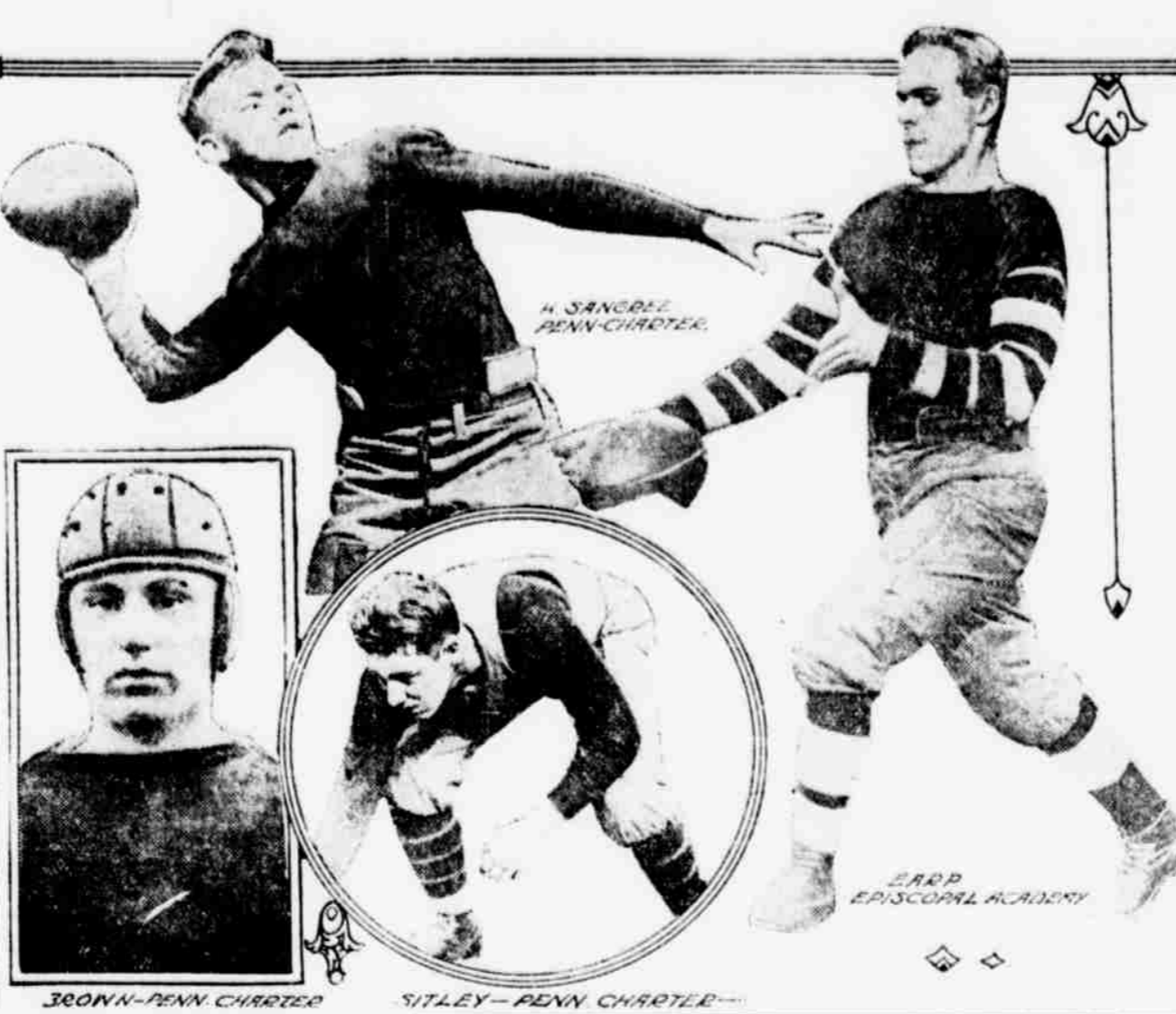
300-N-PENN CHARTER. SITLEY-PENN CHARTER.