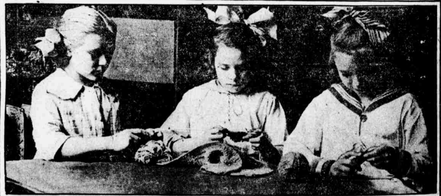
KNITTING USEFUL THINGS FOR SAMJEES NOT LIMITED TO GROWN-UPS The little inmates of the Church Home for Children, Fifty-eighth street and Baltimore avenue, are working daily upon the articles so badly needed overseas.