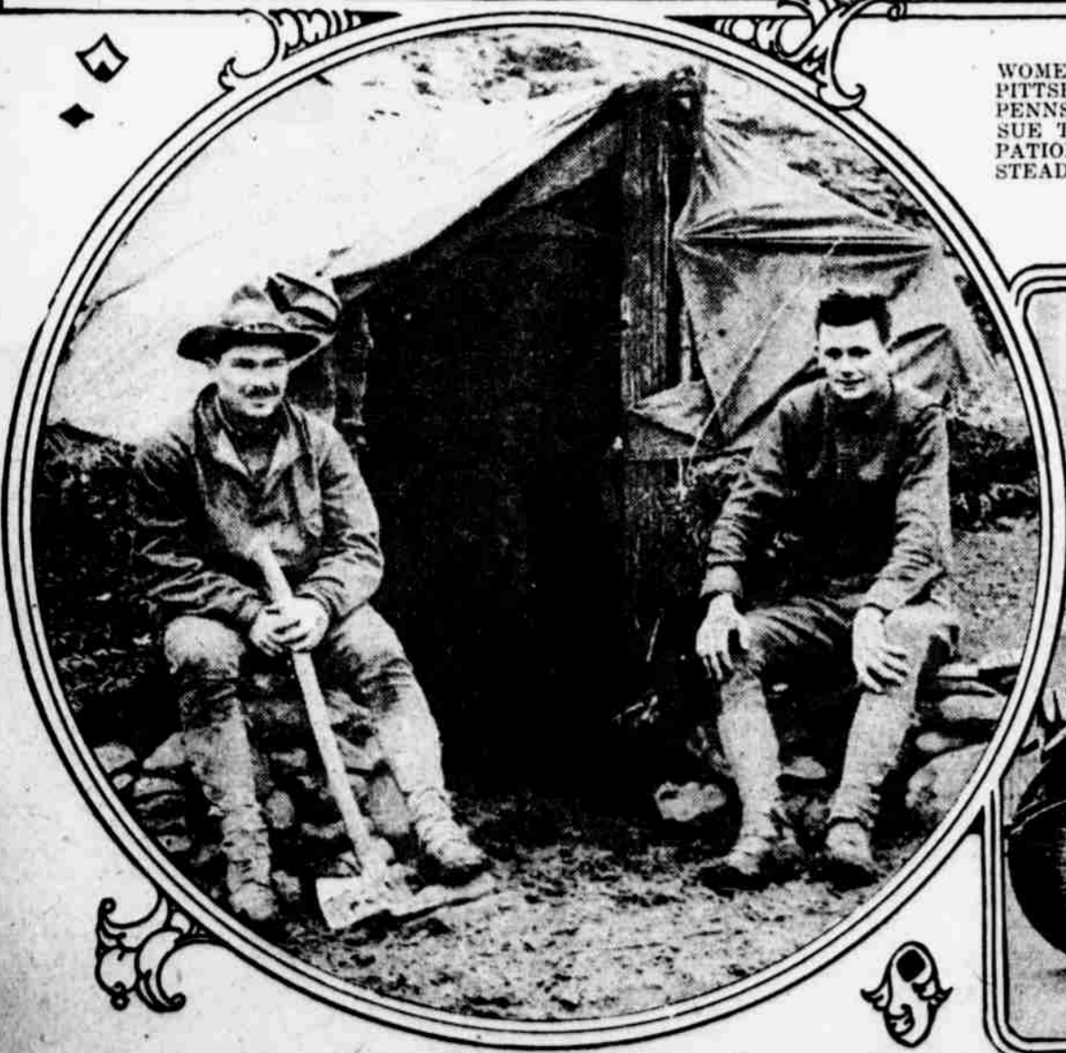
IN THE FIRST-LINE TRENCHES NEAR ALLENTOWN About 2000 men in training for ambulance work have left their camp on the Fair Grounds at the up-State city and have "dug in" at a bivouac some four miles away.