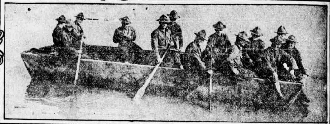
FUTURE ARMY ENGINEERS FAMILIARIZE THEMSELVES WITH GANVAS PONTOONS In preparation for the day when they will be called on to bridge the streams of northern France, they are trained in this sort of navigation.