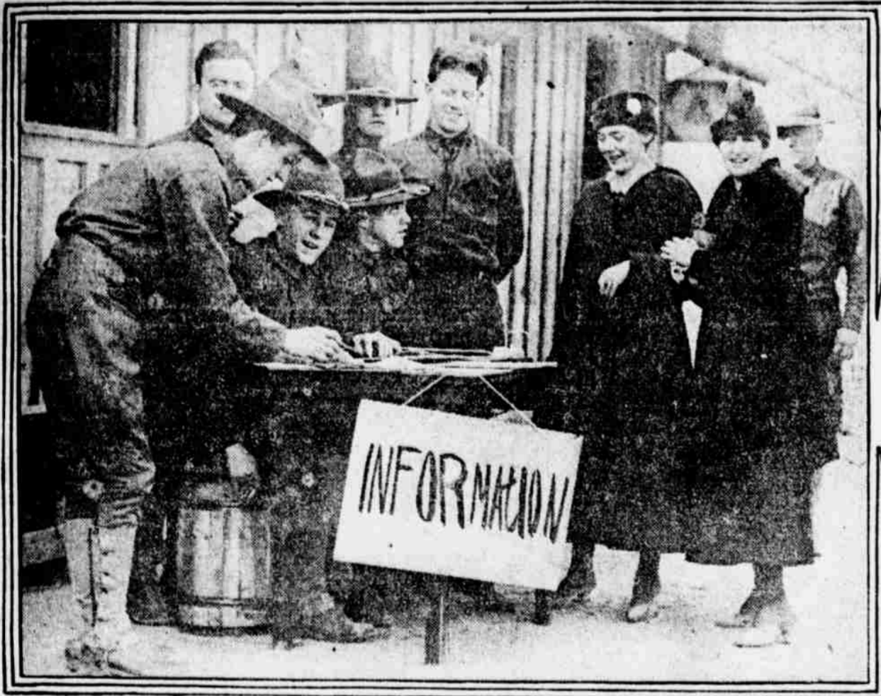
WHERE MISSING SWEETHEARTS ARE FOUND AT CAMP MEADE The information bureau at the nearby cantonment does a land office business Sundays, giving Philadelphia visitors the whereabouts of friends and loved ones.

PHILADELPHIA NEWS PREDOMINATES IN A PHOTOGRAPHIC RESUME OF THE DAY'S HAPPENINGS